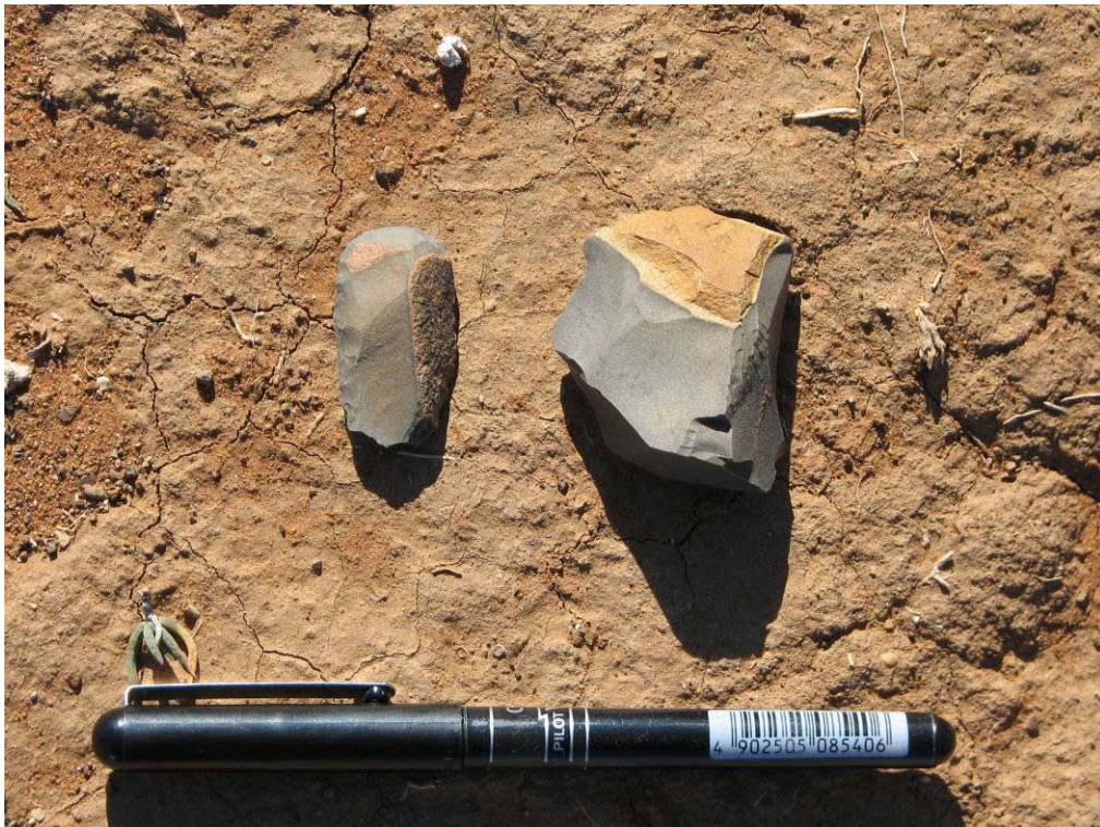
Later Stone Age end/side scraper and core.