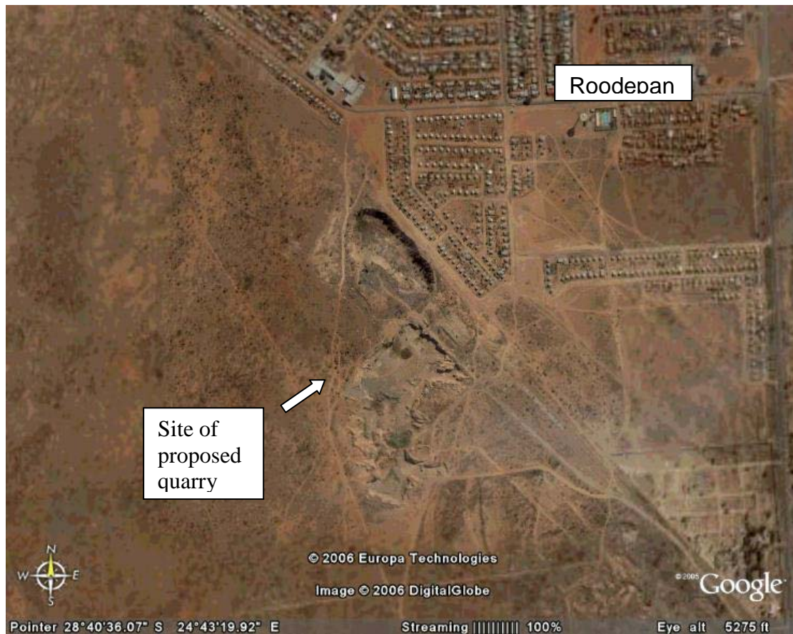
Google Earth image showing the site of the proposed quarry just south of Roodepan suburb.