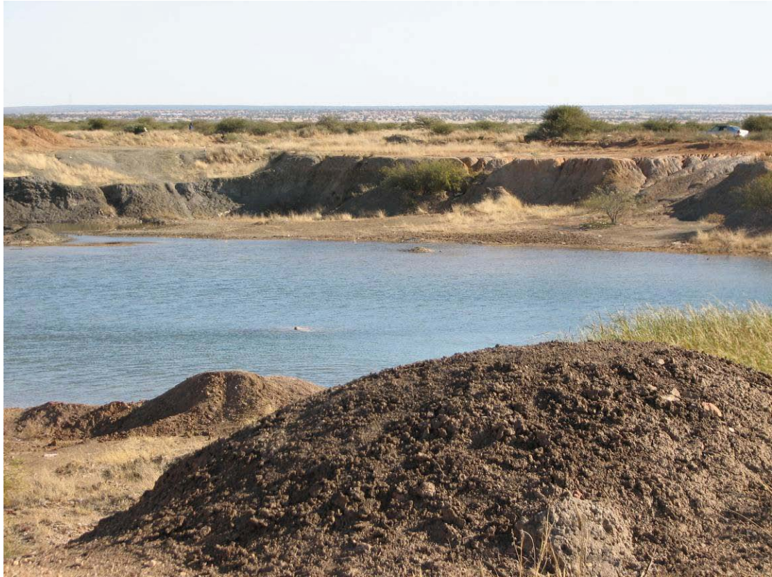
The proposed quarry is on the far side of the existing (usually dry) quarry shown in this image.