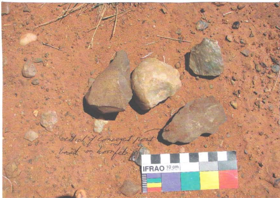
Fig 4. The four better artifacts that were found.