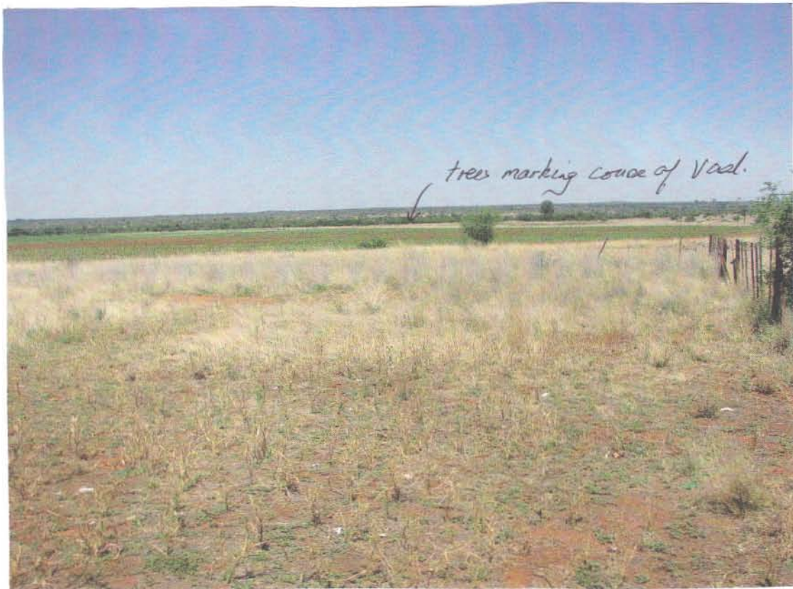
Fig 3. View of lower half of Portion 4, Slyphlip North 32