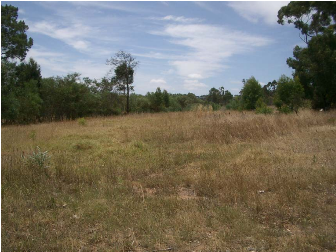
Figure 4. The site facing west.