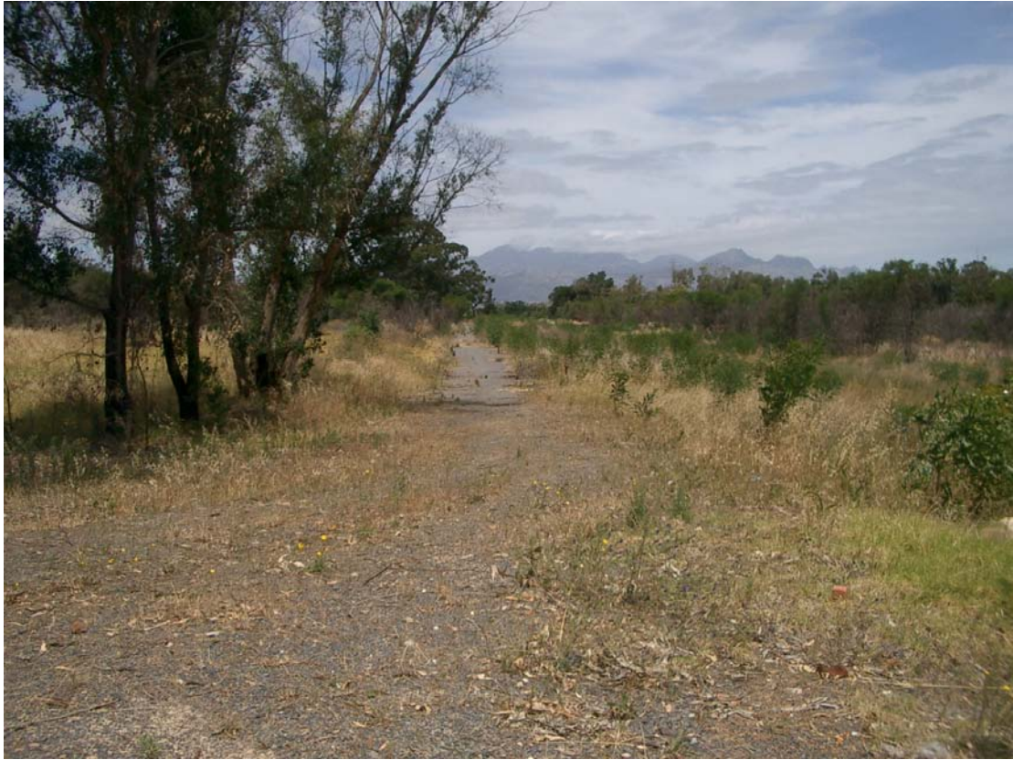
Figure 3. The site facing east.