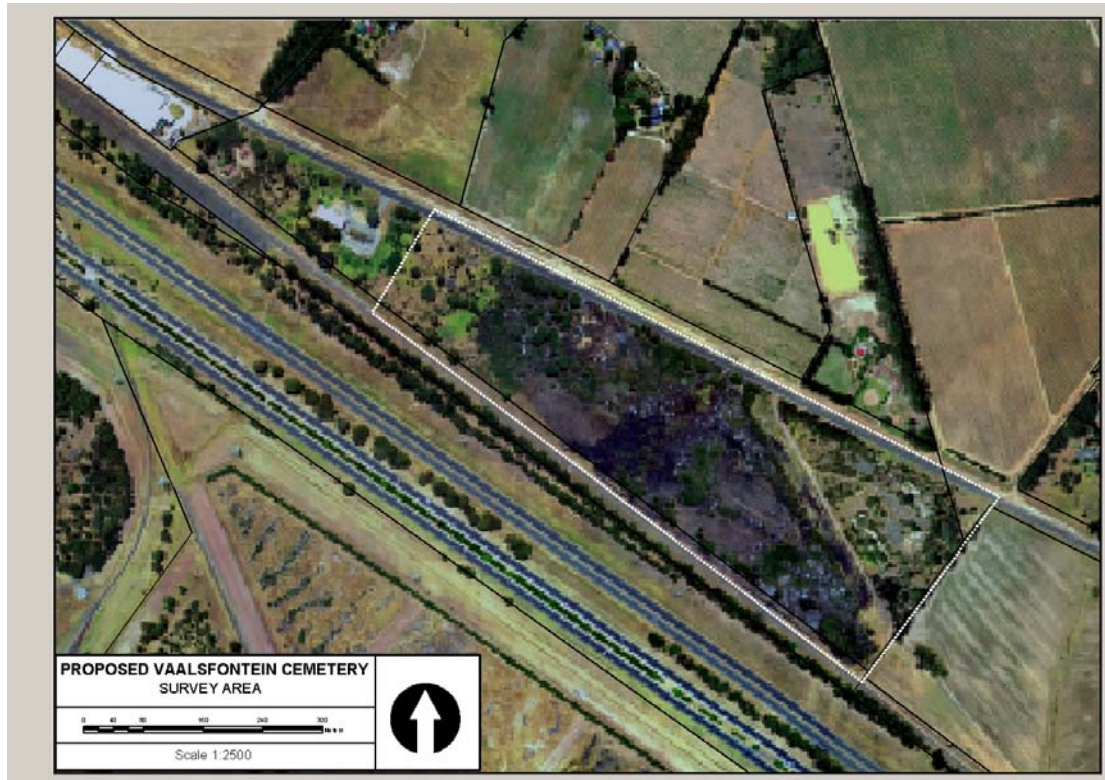
Figure 2. Aerial photograph of the affected property.