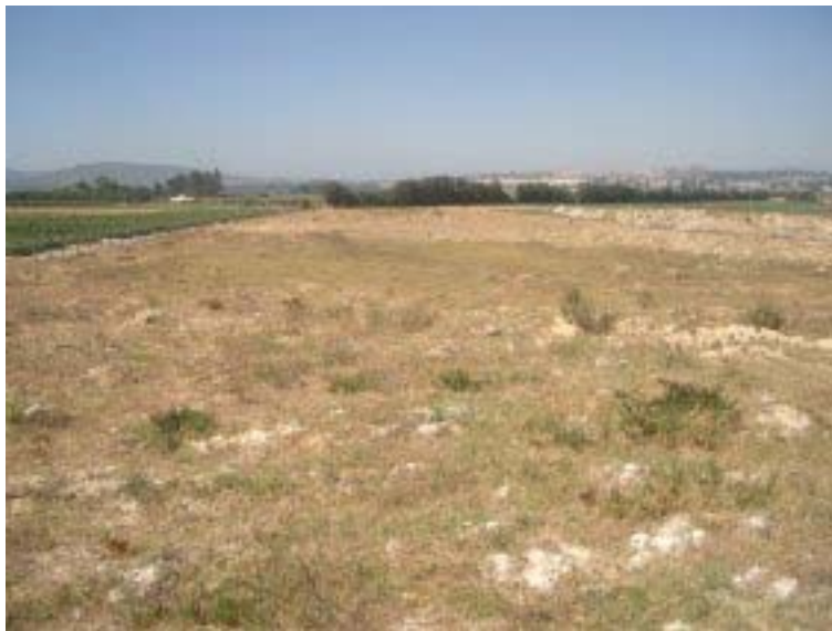
Figure 4. View of the site facing west. Note the vineyards on the left and earthworks related to low cost housing on the right.