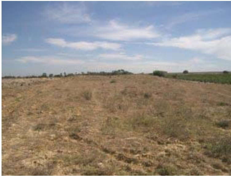
Figure 3. View of the site facing east. Vineyards border the site on the right and low cost housing on the left.