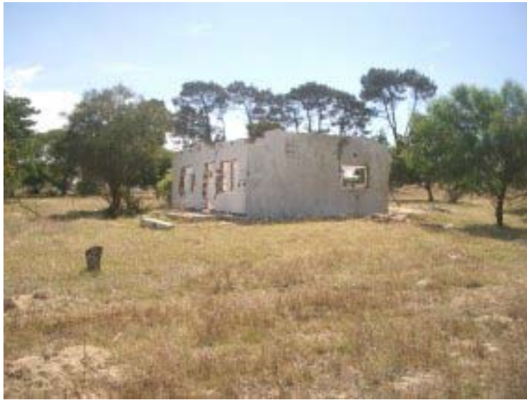
Figure 5. Ruins of modern farmhouse.