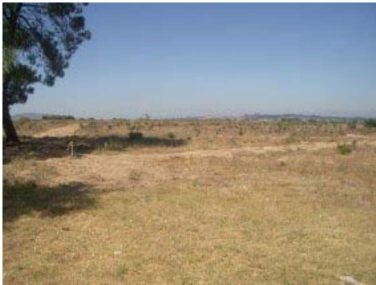
Figure 6. View of the site facing west from the ruined farmhouse.