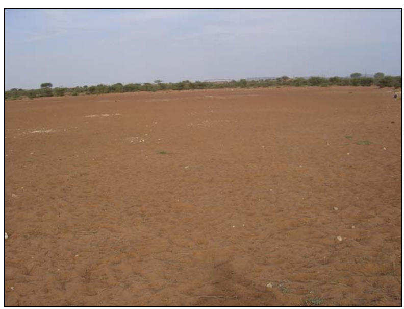
Fig.1 View across the existing sports field at Geelboom.