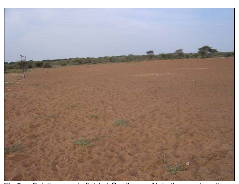
Fig.3 Existing sports field at Geelboom. Note the sandy soil.