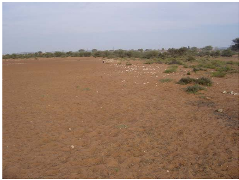
Fig.2 Existing sports facility with brush on the periphery.