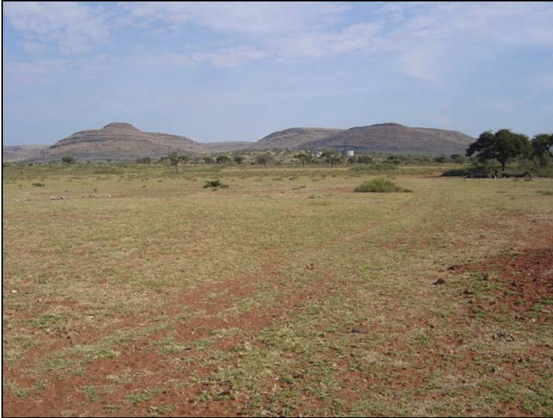
Fig.1 General view across the proposed area at Maruping.