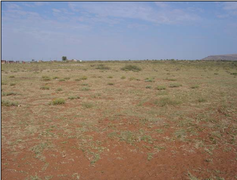
Fig.3 The proposed area on the outskirts of the township of Maruping.