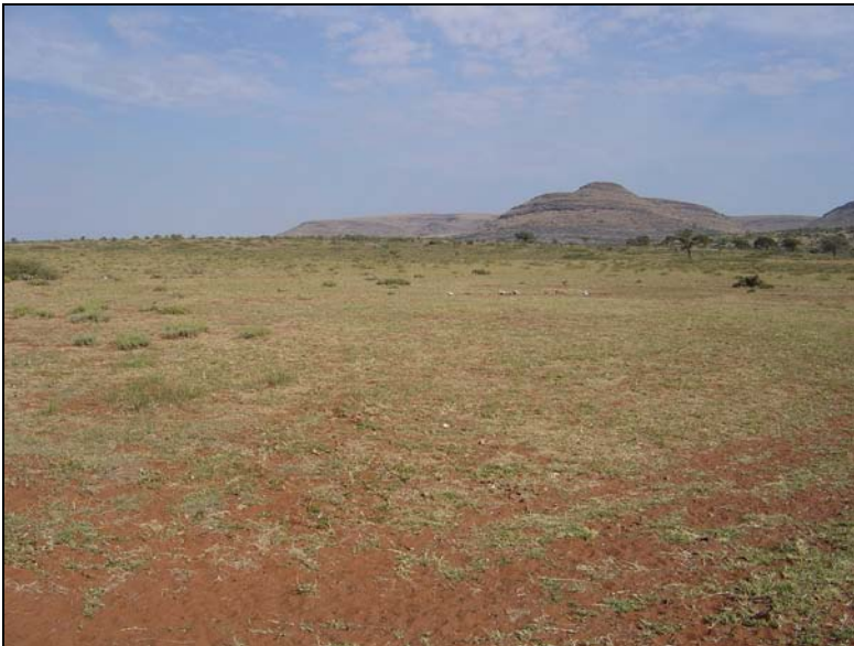
Fig.2 View across the proposed area for the sport stadium at Maruping.