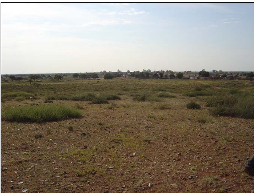
Fig.4 View from the highest point across the proposed area of development at Maruping.