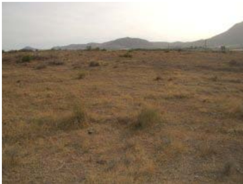
Figure 3. DR1154/10.4 L. The site facing south west.