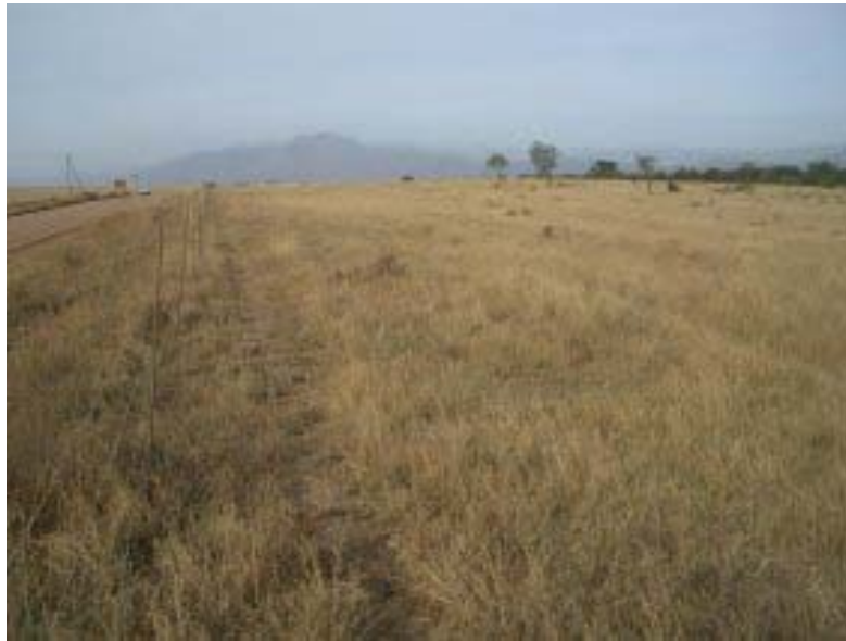
Figure 2. DR1154/10.4 L. The site facing east.

No archaeological heritage remains were located in the proposed footprint.