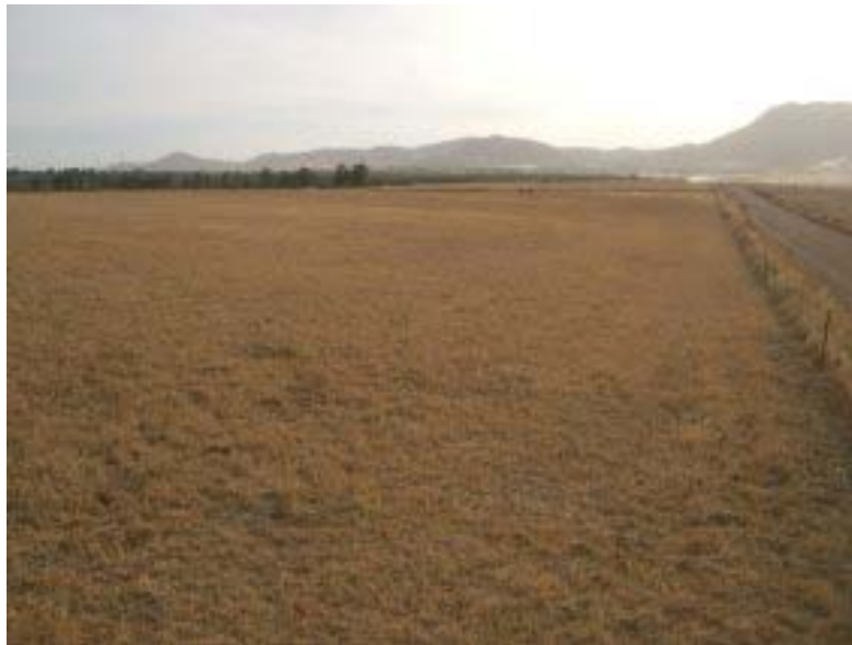
Figure 5. DR1154/8.4 L. The site facing south west.