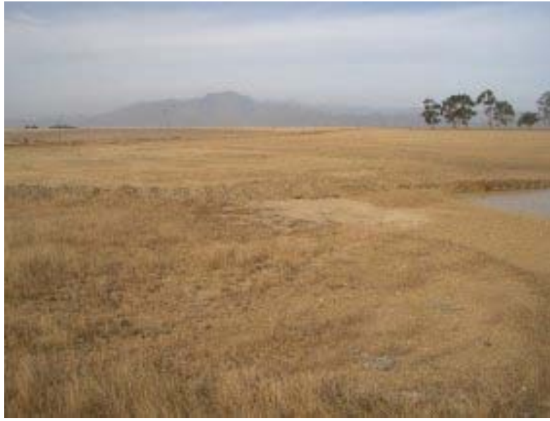
Figure 4. DR1154/8.4 L. The site facing east.

No archaeological heritage remains were located in the proposed footprint.