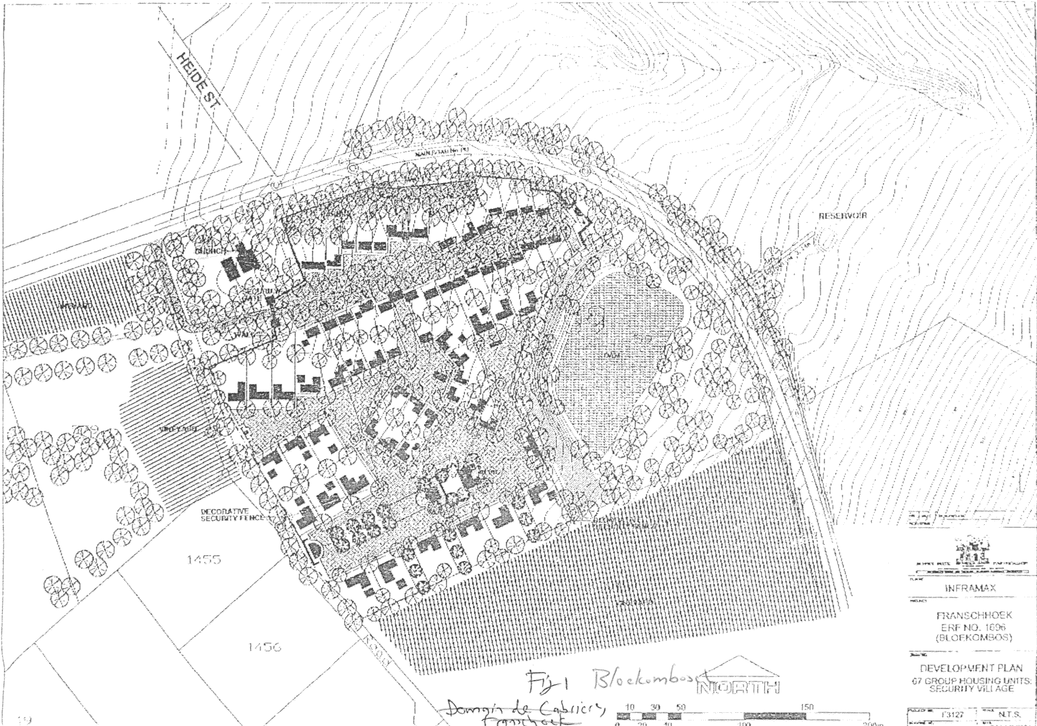
Fig 1 Bloekombos NORTH Damin de Cabriery Franschhoek