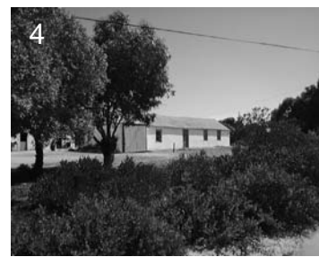
4 Occupied. Much original detail.