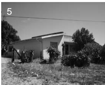
5 Occupied. Modernised. Some original fabric may remain.