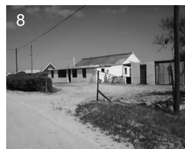
8 Occupied. Much original detail