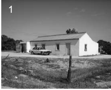
1 Occupied. Much original detail