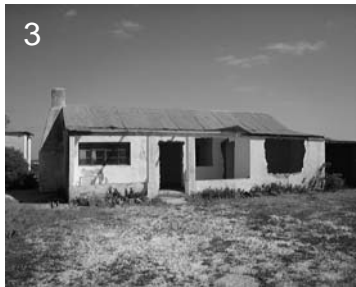
3 Vacant. Some original detail but frames removed.