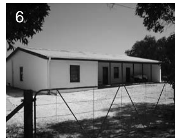
6 Occupied. Modernised. Some original fabric remains.