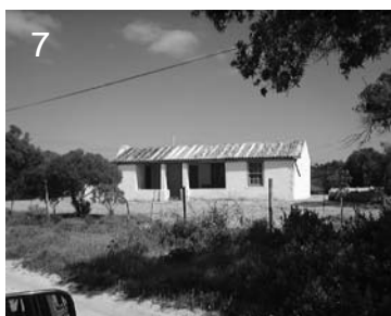
7 Occupied. Much original detail