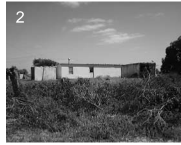
2 Vacant. Some original detail