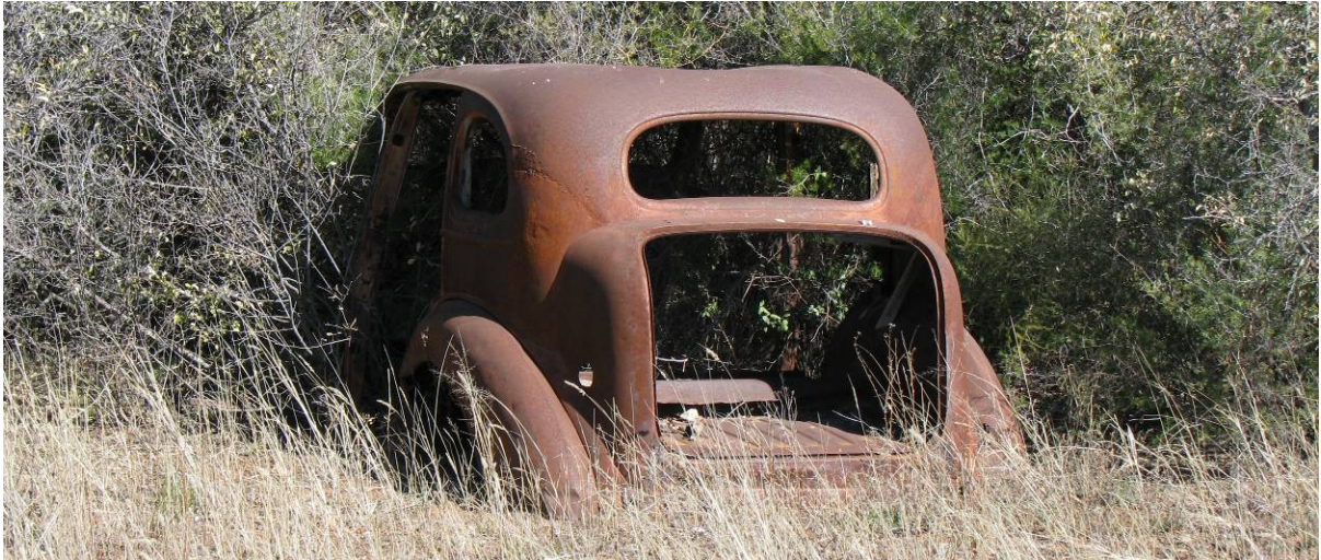
Twentieth century traces.