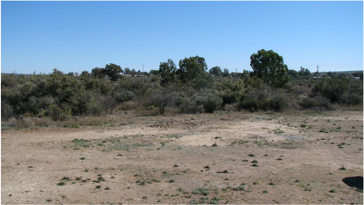
Disturbed terrain at Shone Pipe, Carter Block (above and below).