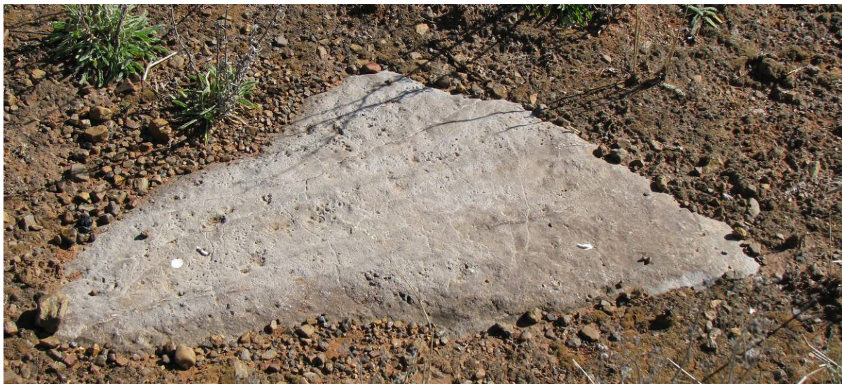
Dolomite exposure: no traces of engravings.