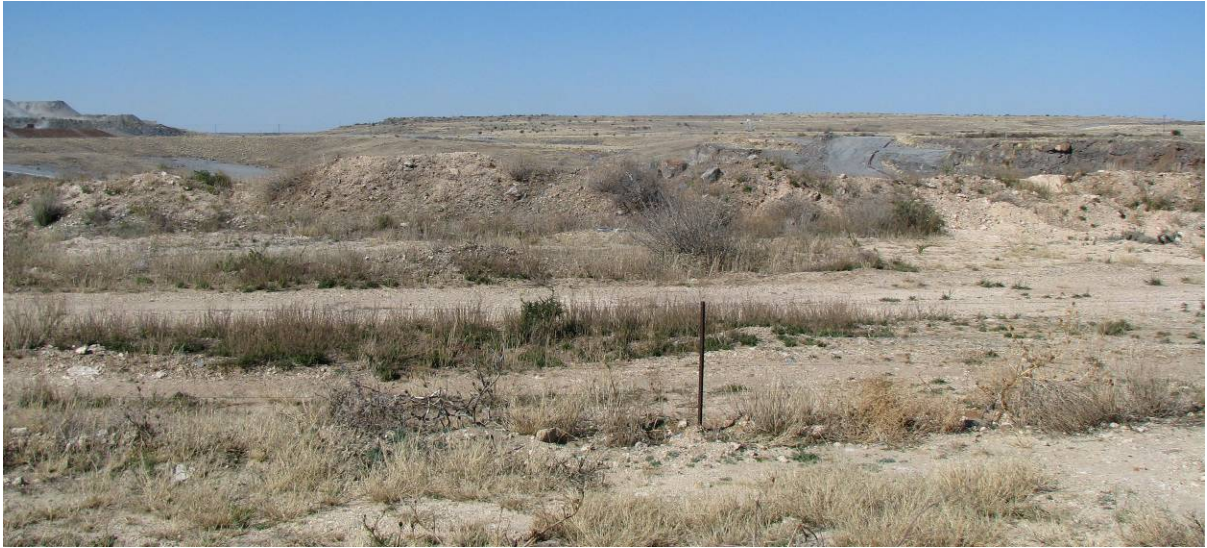
View to the south indicating the open cast mine (PPC) where part of the Shone kimberlite is exposed.