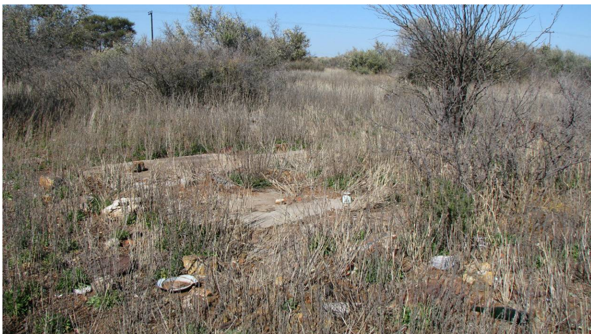
Cement floor of probable mine-worker dwelling with enamel-ware and glass debris in the foreground, later twentieth century.