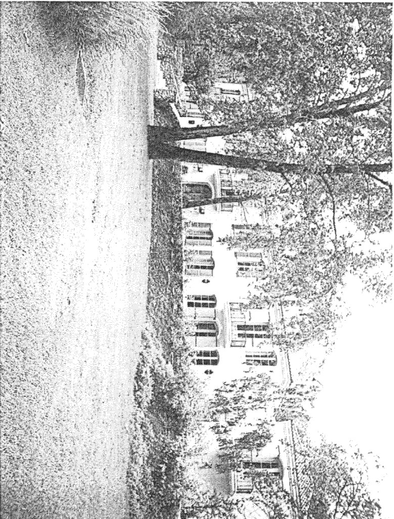
Figure 3. A large modern home is set on the property.