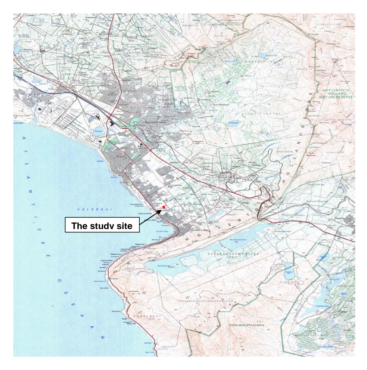
Figure 1. Locality map (3418 BB Somerset West).