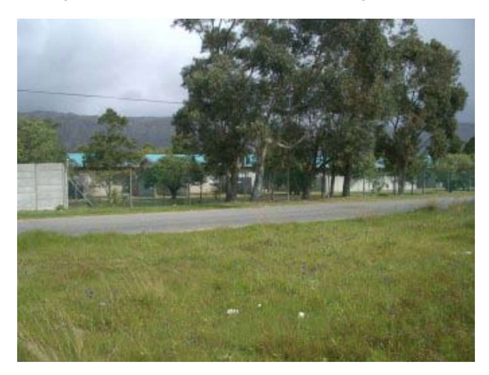
Figure 4. Erf 6336 Strand: View of the caravan park from Disa Road.