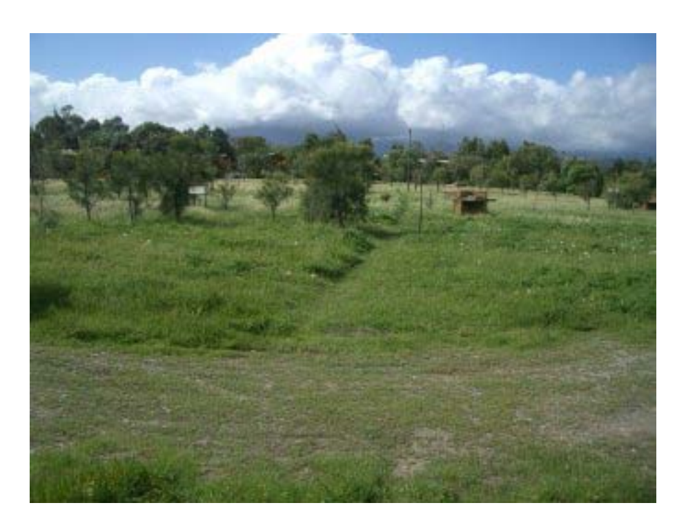
Figure 3. Erf 6336 Strand: View of the site facing north-east.