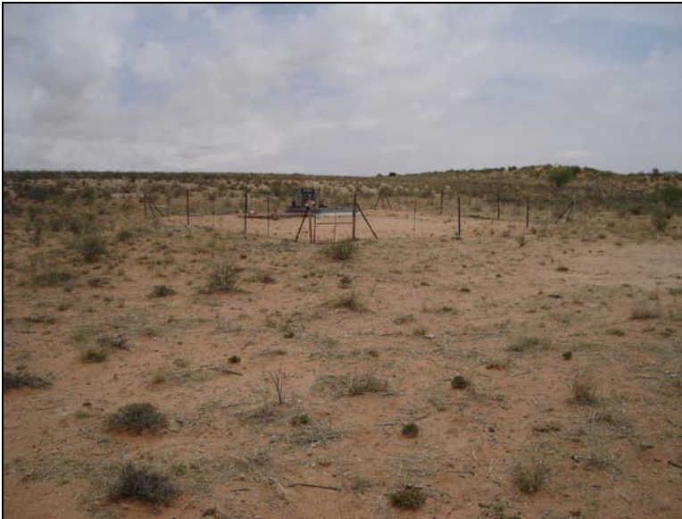
Fig.14 Graves at BP 6 by Km 55 on Mier 585