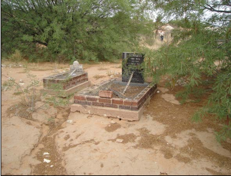
Fig.8 Graves near BP 3 at Km 30 on Mier 585