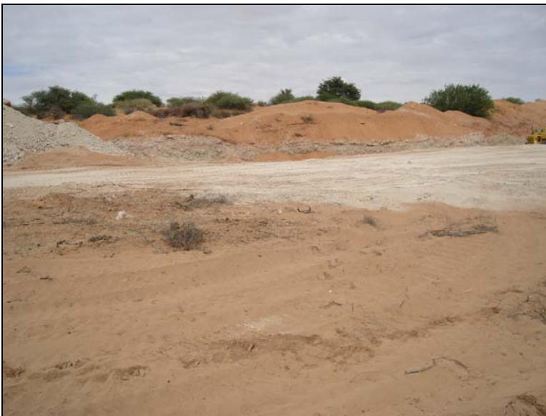
Fig.7 BP 3 at Km 30 on Mier 585.