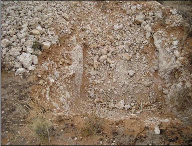
Fig.2 BP 1 test pit.