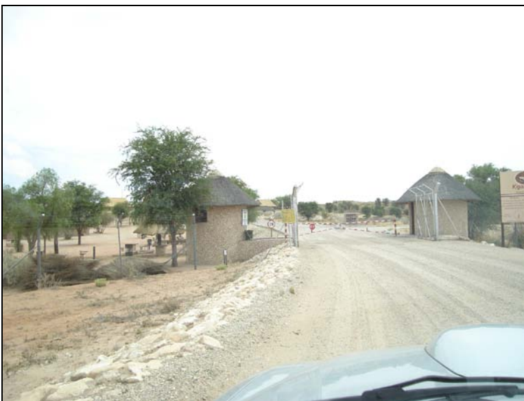
Fig.15 Kgalagadi Trans Frontier Park entrance at Twee Rivieren.