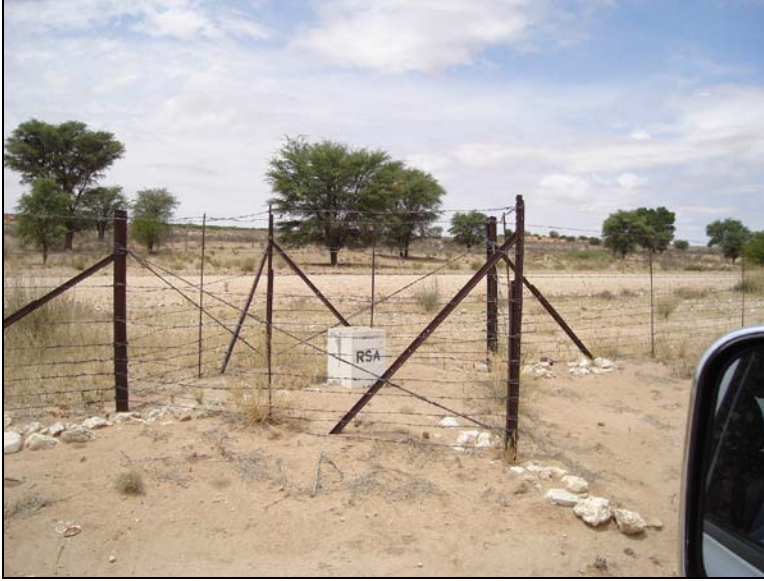
Fig.16 Border fence between South Africa and Botswana near Twee Rivieren.