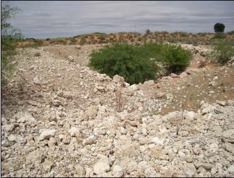
Fig.10 BP 4 at Km 36,5 on Mier 585.