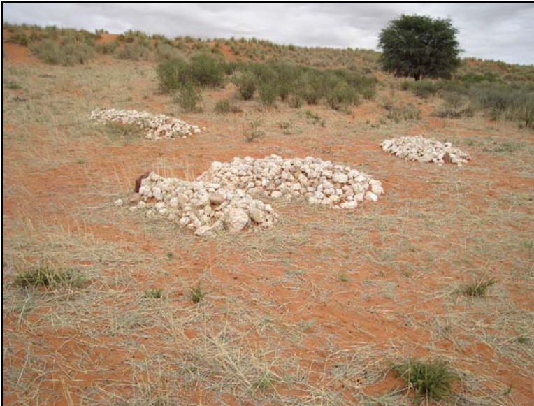
Fig.12 Graves at BP 5 Km 41,5 on Mier 585.