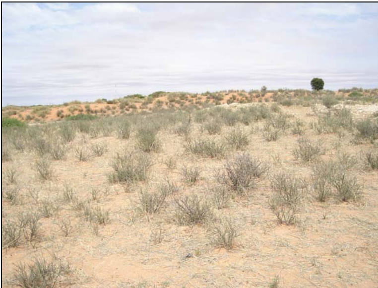
Fig.9 BP 4 at Km 36,5 on Mier 585.