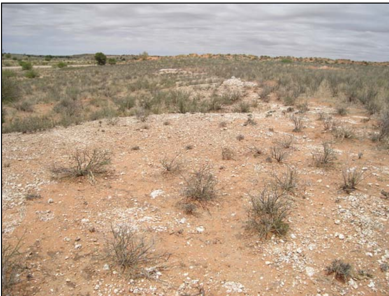
Fig.13 BP 6 at Km 55 on Mier 585.