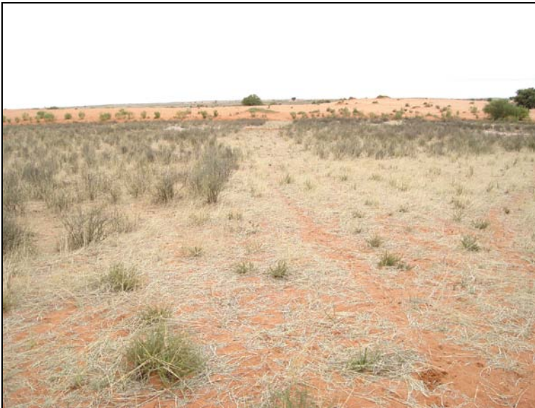
Fig.11 BP 5 at Km 41,5 on Mier 585.