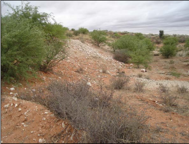
Fig.6 BP 2 Existing quarry at Km 27,8 on Mier 585.