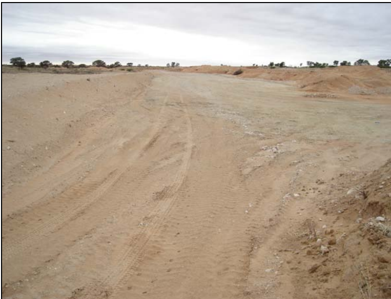
Fig.1 BP 1 at Km 13, Mierhooppan 120.