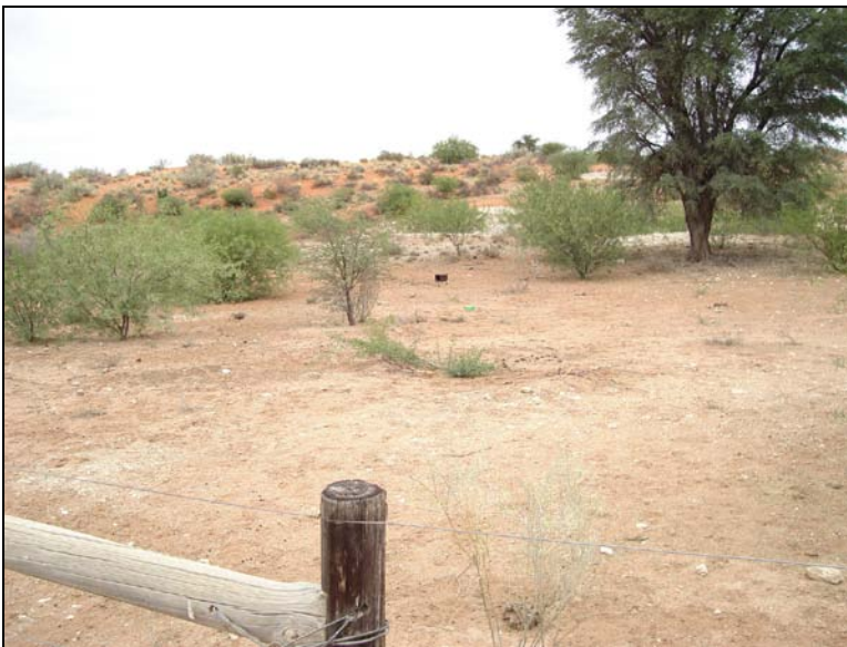
Fig.5 BP2 at Km 27,8 on Mier 585.