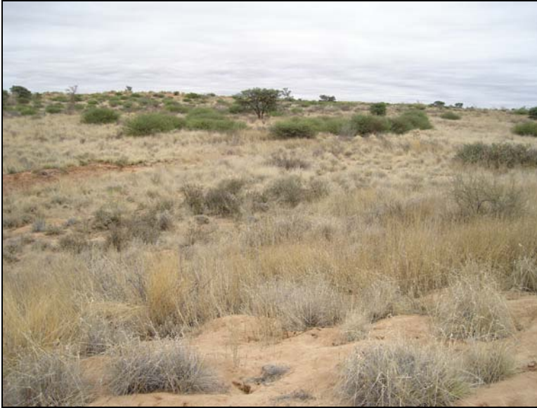
Fig.4 BP 1b extension at Km 13,9 Mierhooppan 120.