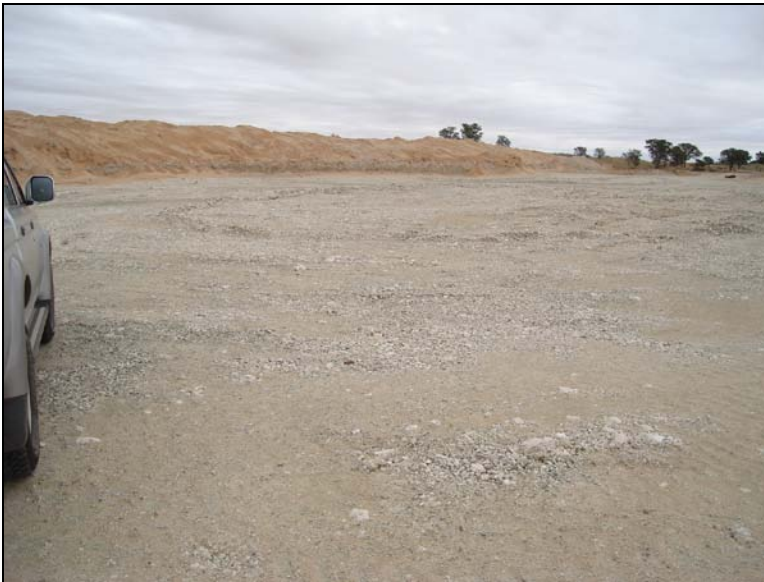
Fig.3 BP 1 at Mierhooppan 120.