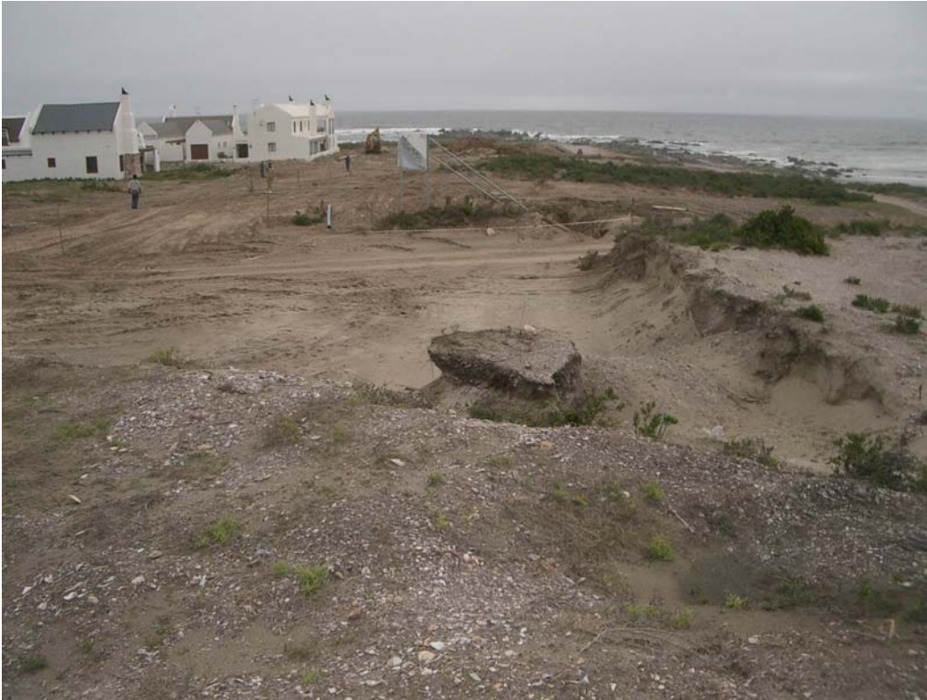
Figure 2. Archaeological monitoring Portion 1 of Erf 1050 Paternoster. Site facing west.