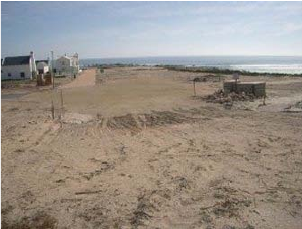
Figure 3. Archaeological monitoring Portion 1 of Erf 1050 Paternoster. Site facing west.