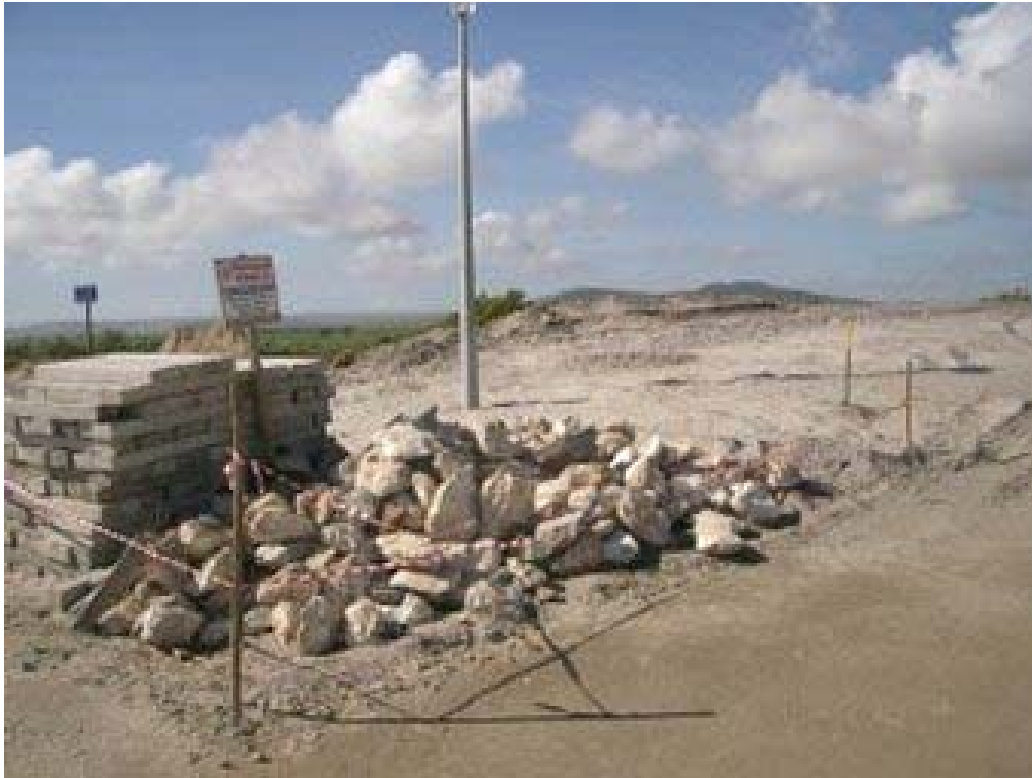
Figure 4. Archaeological monitoring Portion 1 of Erf 1050 Paternoster. Remains of midden in north-eastern portion of site.