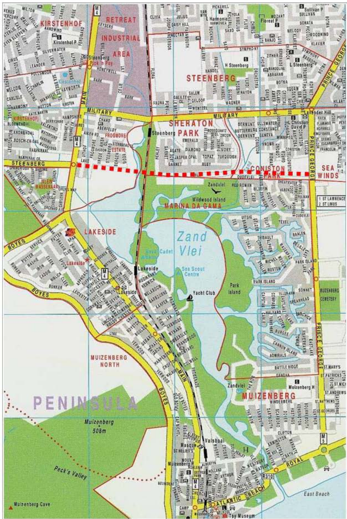
Figure 1. Locality map.