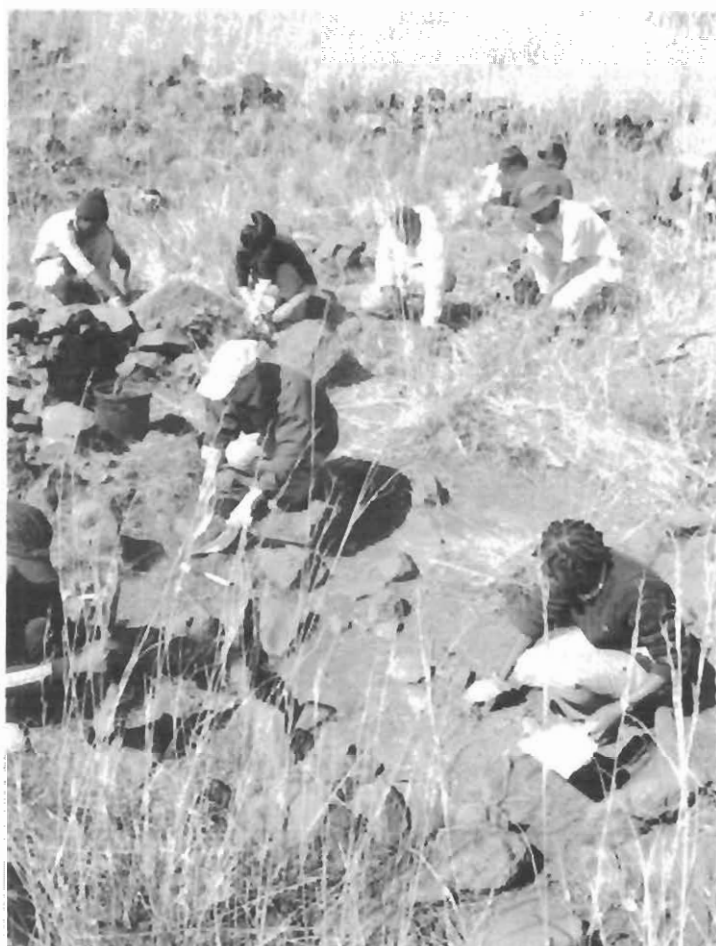
Students clearing stone circles

The photographs below give an indication of the excavation carried out.