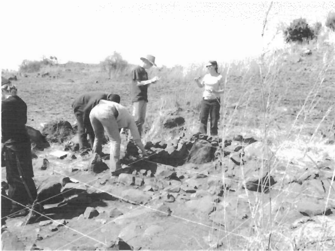
Students mapping stone circles