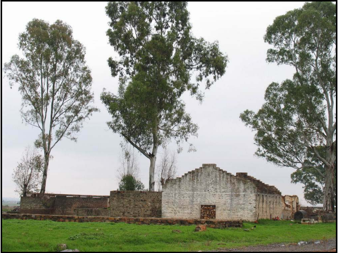
Fig. 4. Part of the old farmstead.