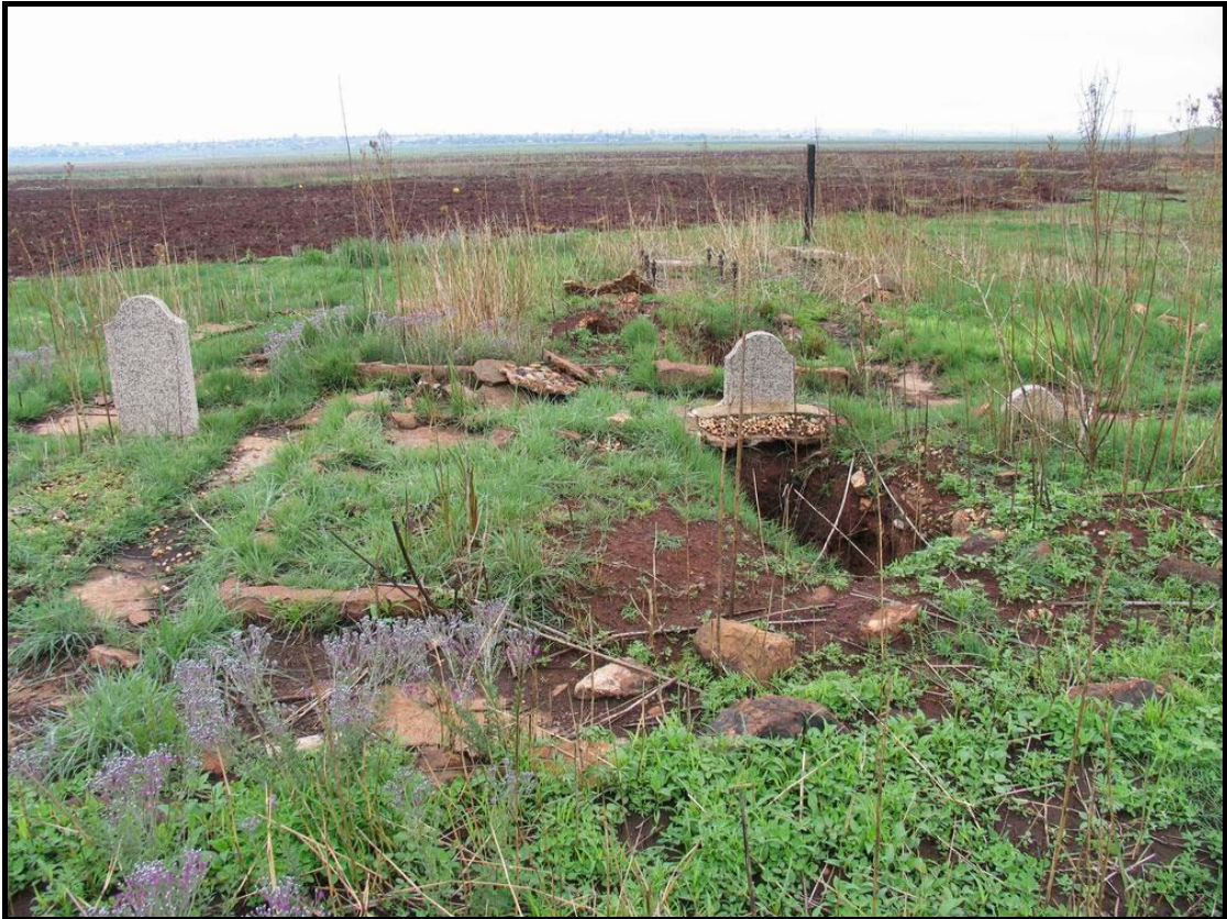
Fig. 3. The small farm cemetery.

2. Location : Tamboekiesfontein 173IR – S 26.40973; E 28.22176