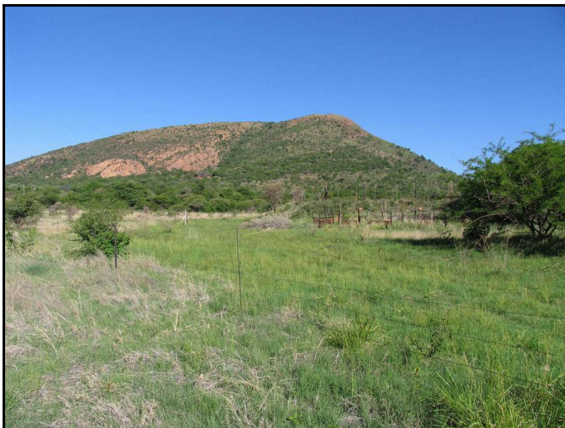
Fig. 2. A view of the site, showing the section that was used for cultivation.

Although a number of buildings occur on the site, they were built by the current owner, who has, since 1994, developed a conference centre on the site. None of these buildings are viewed to have any significance.