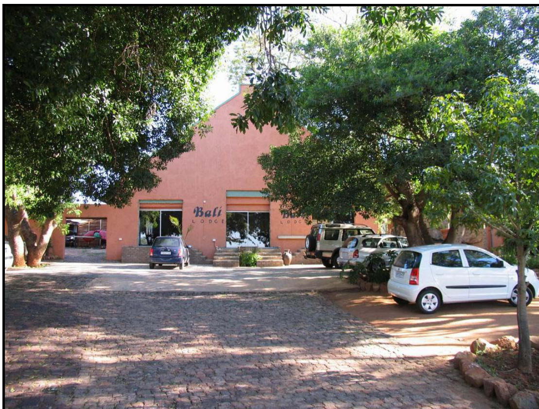
Fig. 3. The entrance to the lodge.