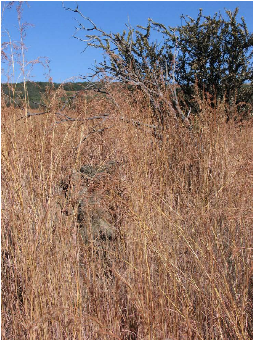
Fig. 1. Iron Age stone walling hidden by the tall grass.