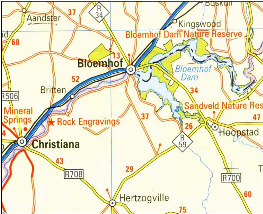
Map 1 The N14 road between Christiania & Bloemhof, North West Province.