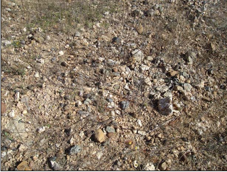
Fig.6 Portion 6. Old prospecting site, Matlabane Stad 299, Bloemhof.