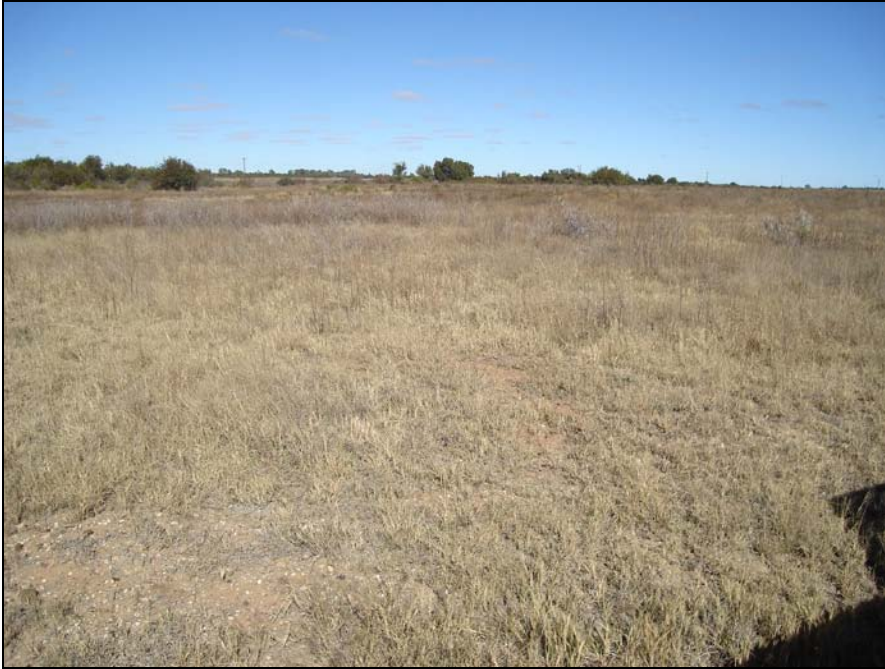
Fig.2 Portion 6 Point B at Matlabane Stad 299, Bloemhof.