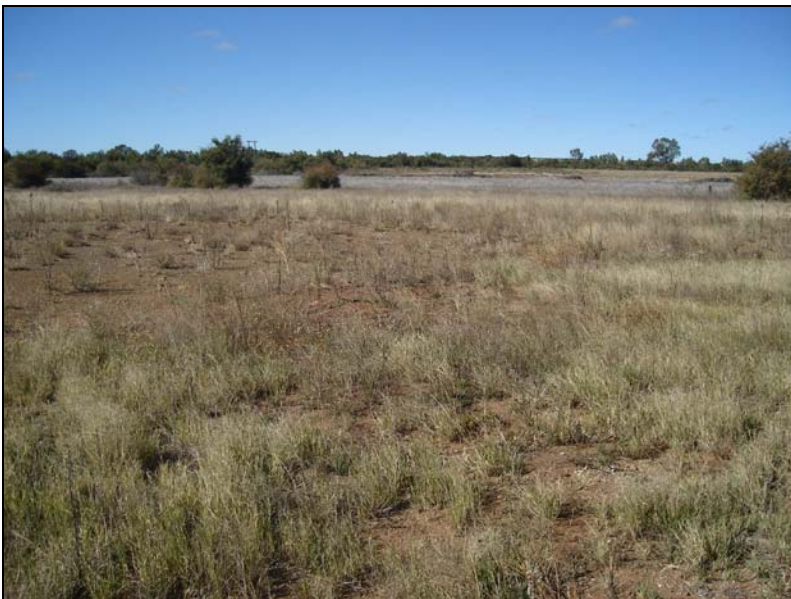
Fig.5 View at Portion 6 Point E at Matlabane Stad 299, Bloemhof.