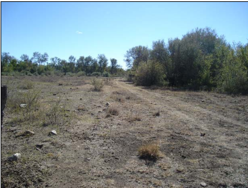
Fig.11 Portion 10 Point B, Matlabane Stad 299, Bloemhof.