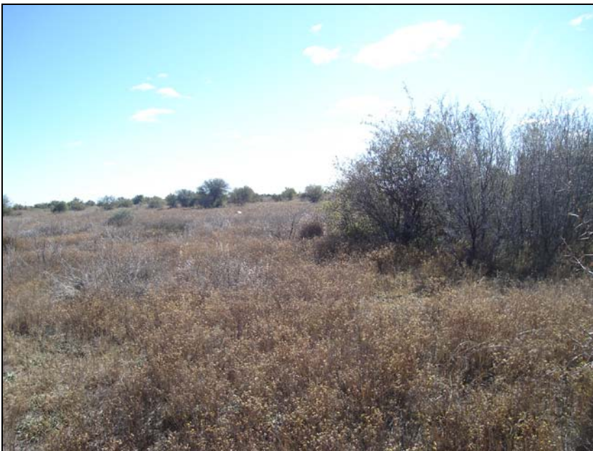
Fig.3 Portion 6 Point C Matlabane Stad 299, Bloemhof.