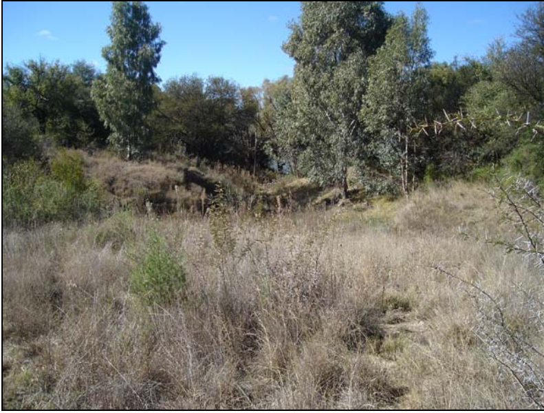
Fig.4 Portion 6 Point D. Note the dense vegetation on the riverbank.