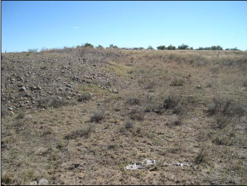
Fig.10 Portion 10 Point A. Old prospecting heap at Matlabane Stad 299, Bloemhof.