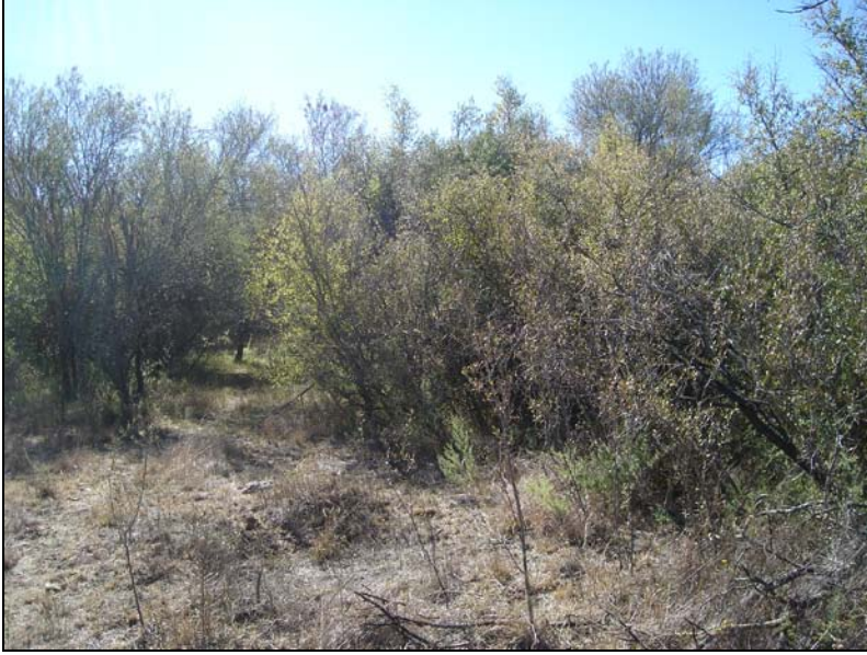
Fig.12 View at Portion 10 Point C, Matlabane Stad 299, Bloemhof. Dense vegetation near the River.