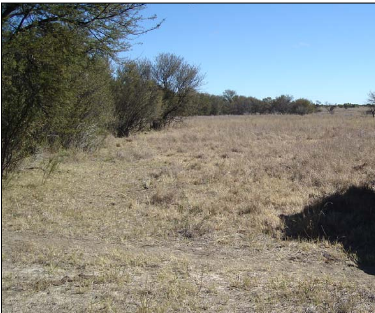
Fig.13 Portion 10 Point D near the River bank, Matlabane Stad 299, Bloemhof.