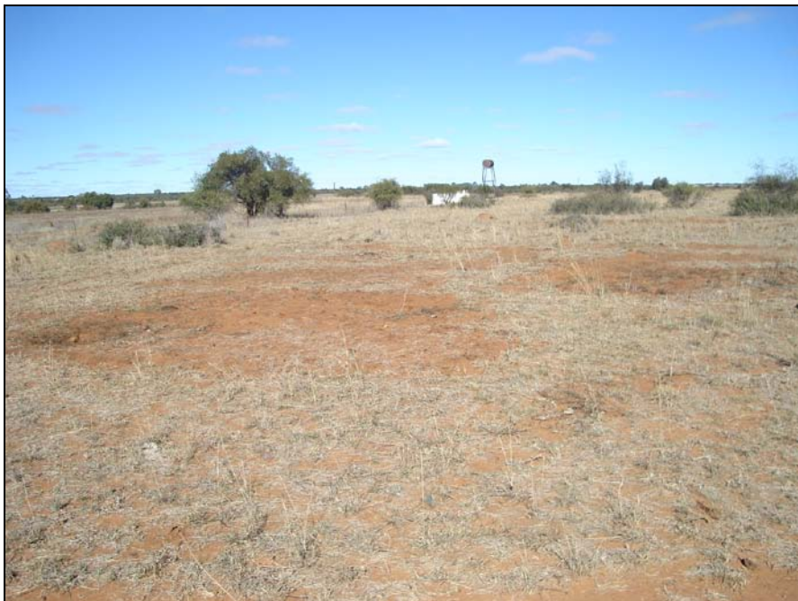
Fig.1 Portion 6 Point A at Matlabane Stad 299, Bloemhof.