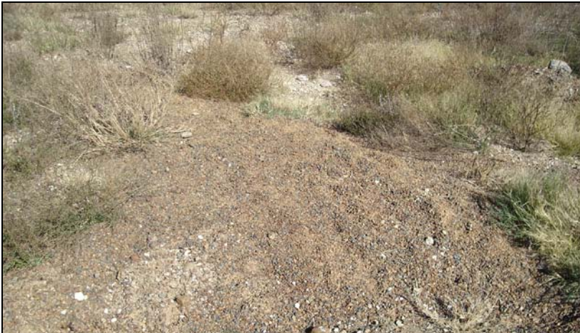
Fig.8 Portion 6. Old prospecting site near Point E, Matlabane Stad 299, Bloemhof.