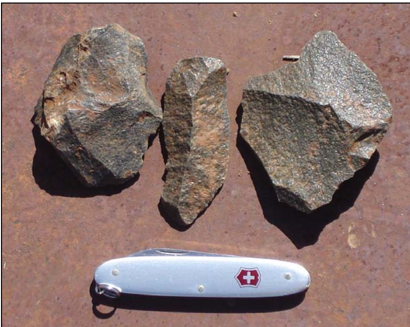
Fig.9 Flakes and scrapers from prospecting heaps near Portion 6 Point E, Matlabane Stad 299, Bloemhof. (Pocket knife=85mm).