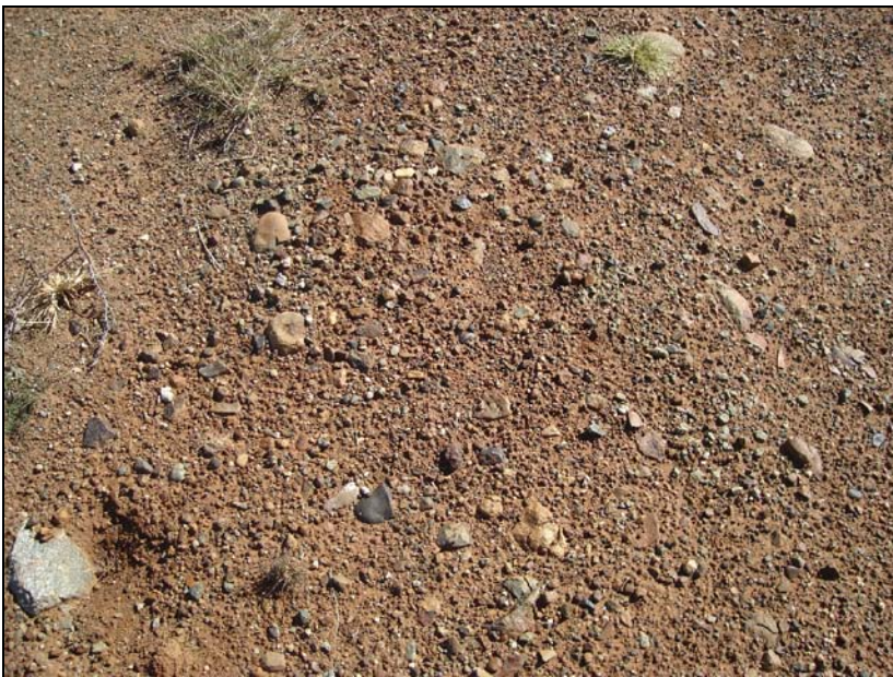
Fig.7 Portion 6. Old prospecting site near Point E, Matlabane Stad 299, Bloemhof.