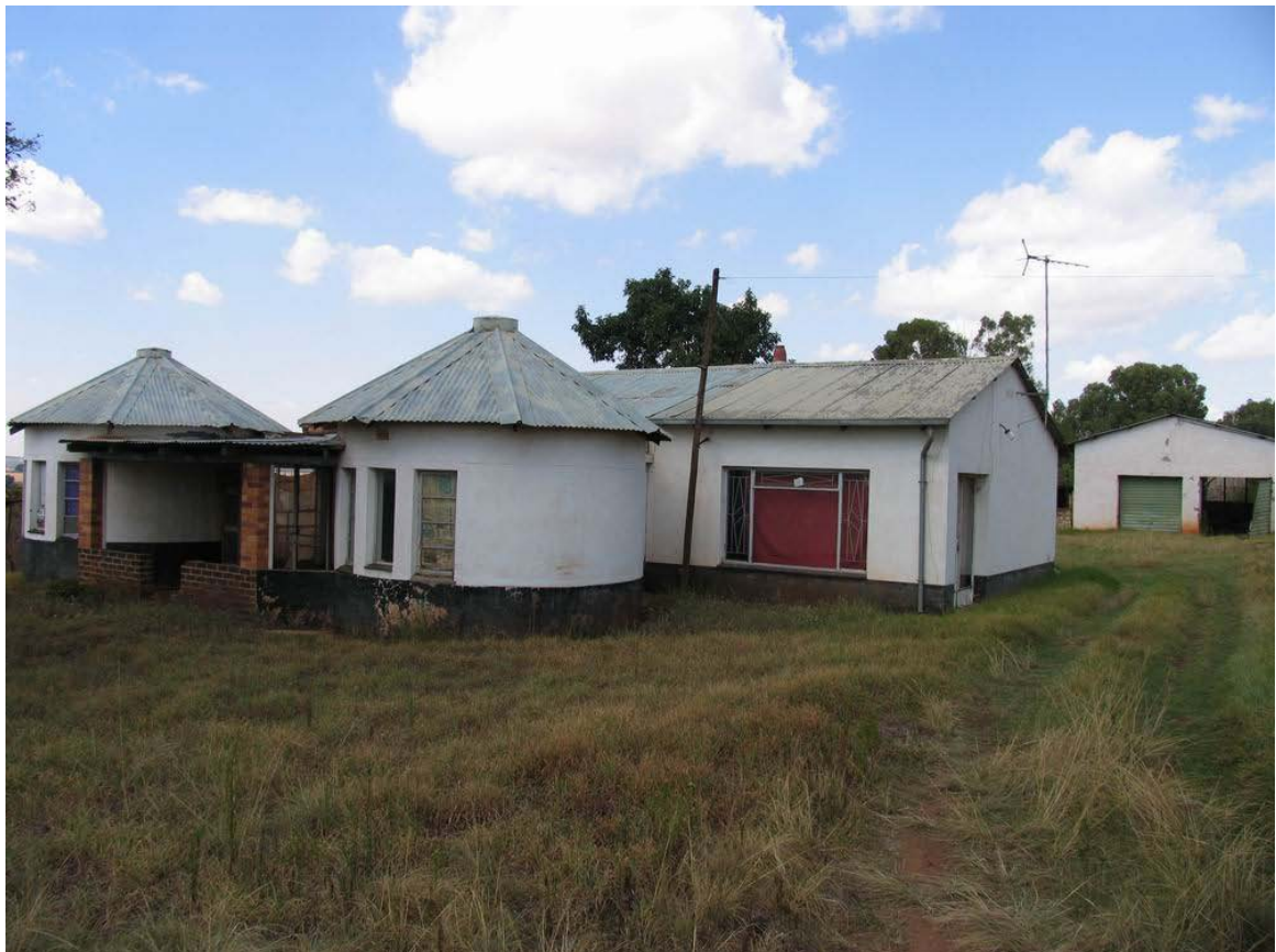
Fig. 2. The old homestead on the property.