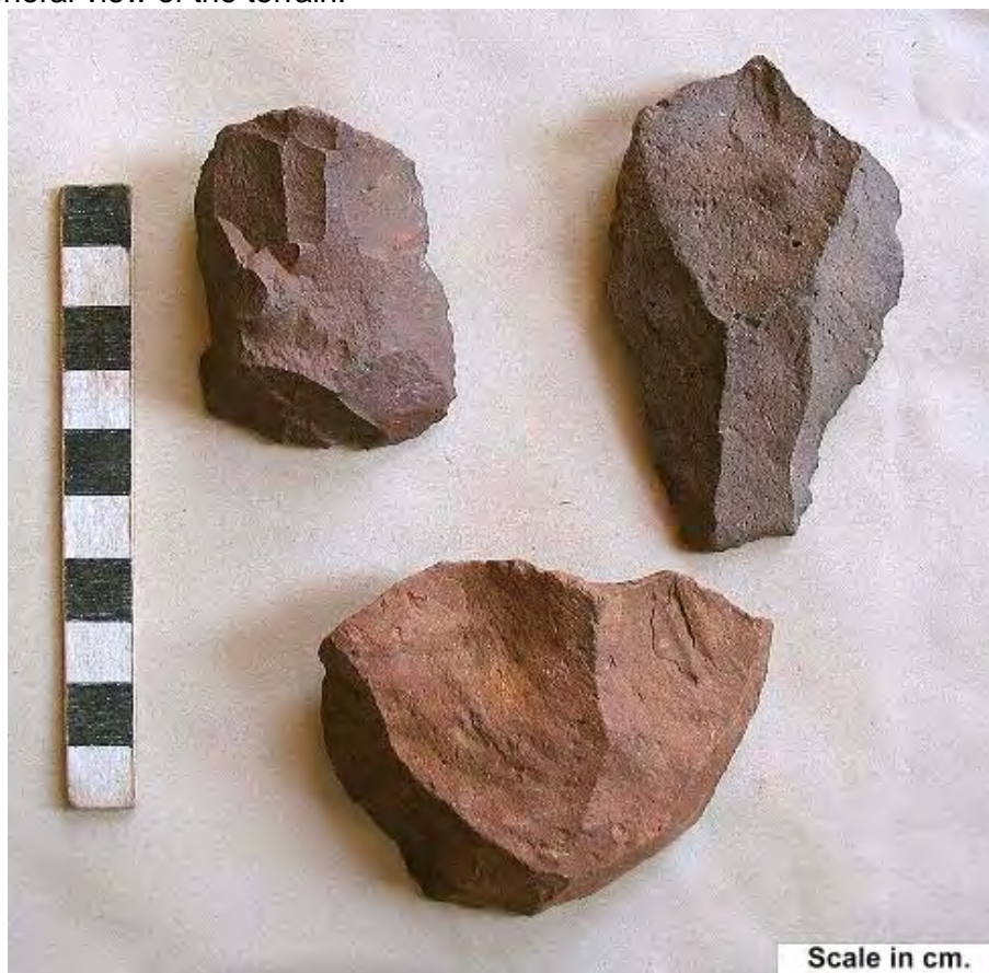
Fig 2. Middle Stone Age flakes.