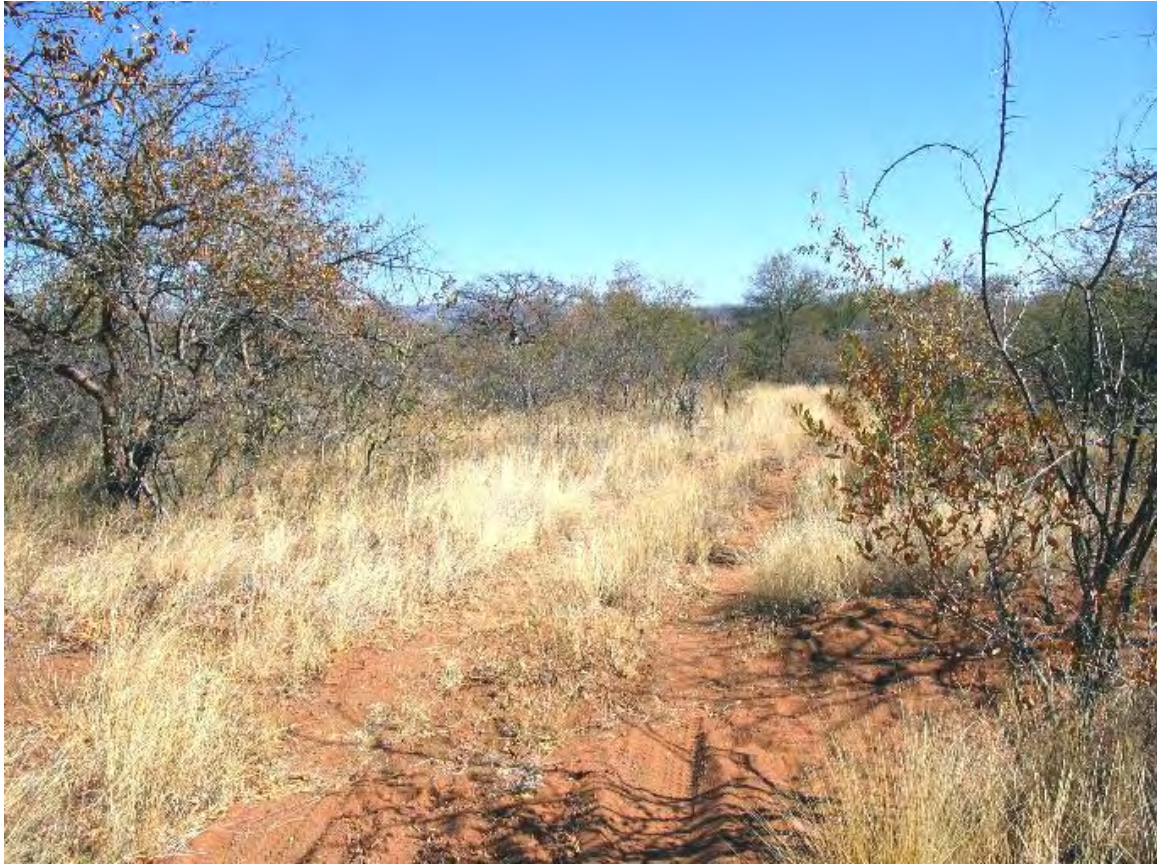
Fig 1. General view of the terrain.