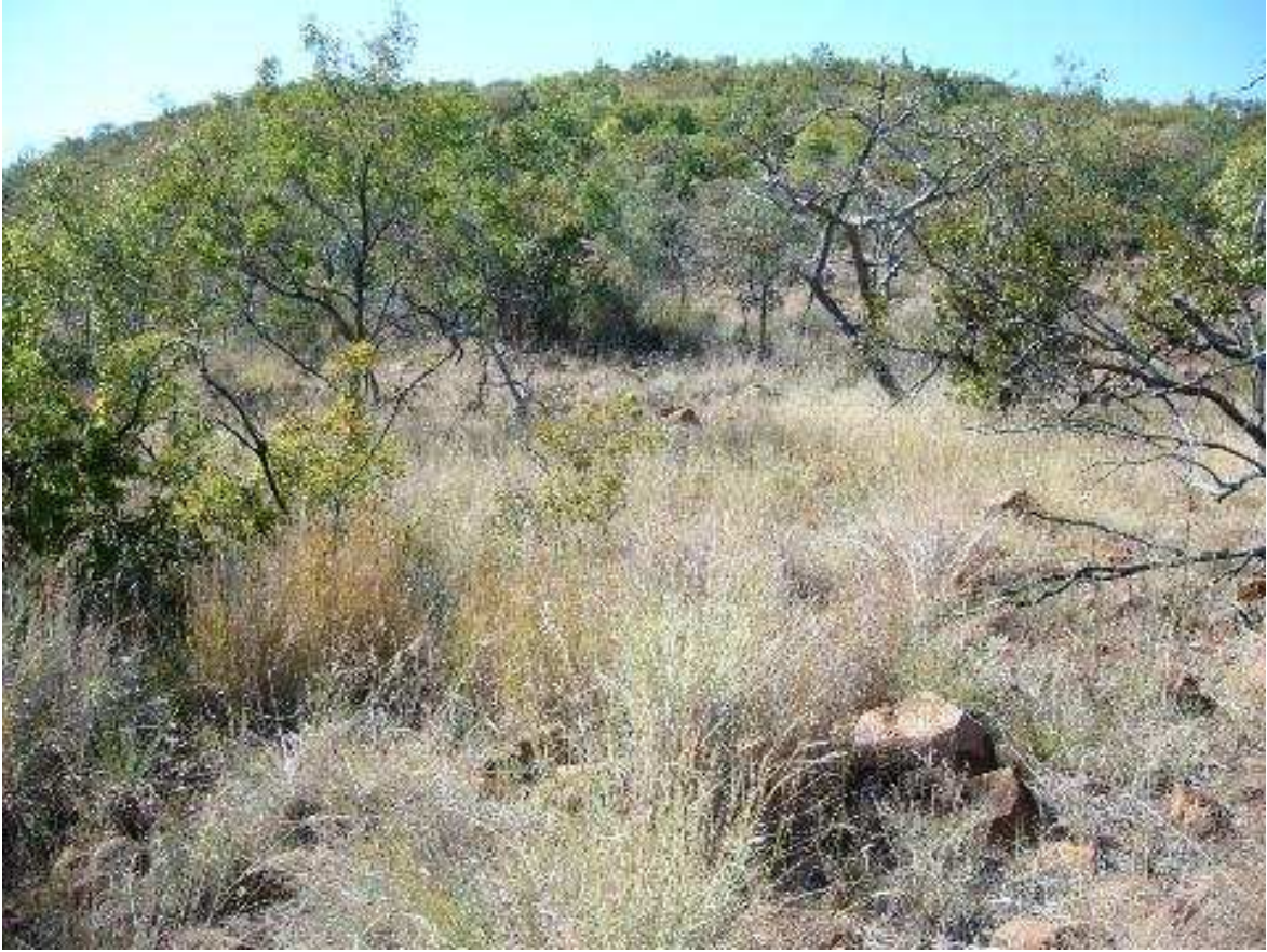
Fig 1. General view of the terrain and vegetation.