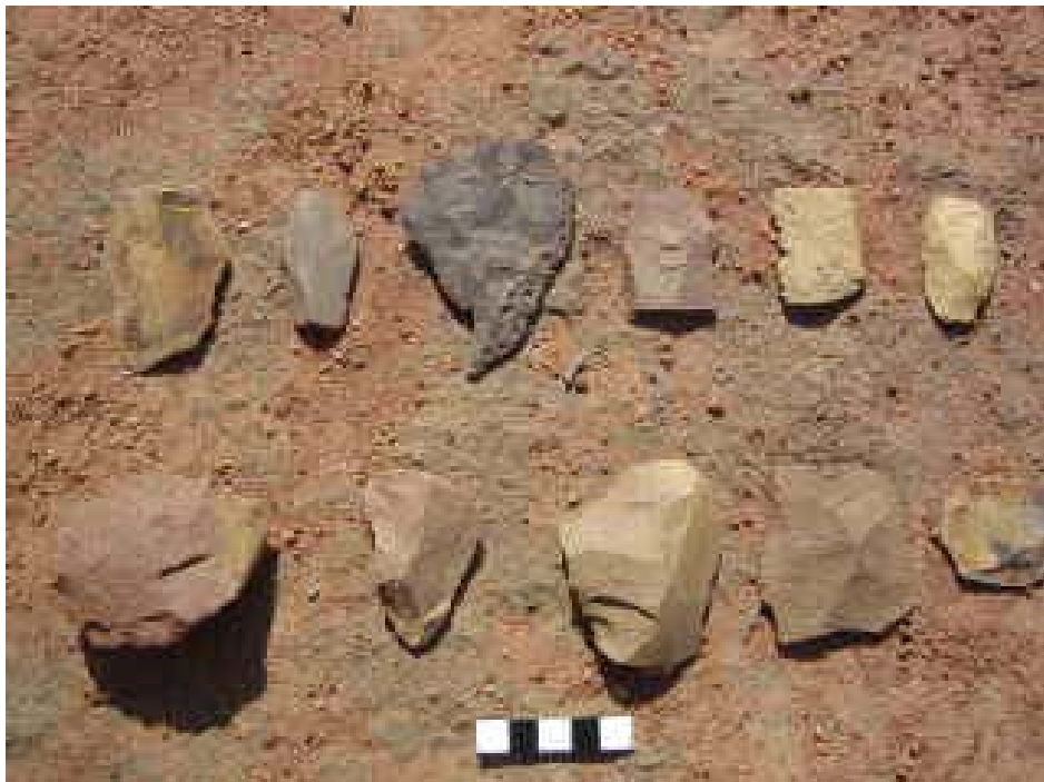
No. 1. Stone Age flakes and a core