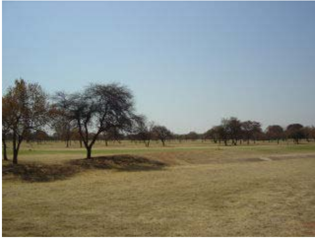
No. 2. Golf course