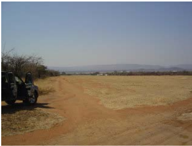
No. 3. Airport