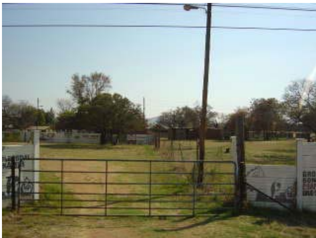
No. 4. Site of Agriculture show