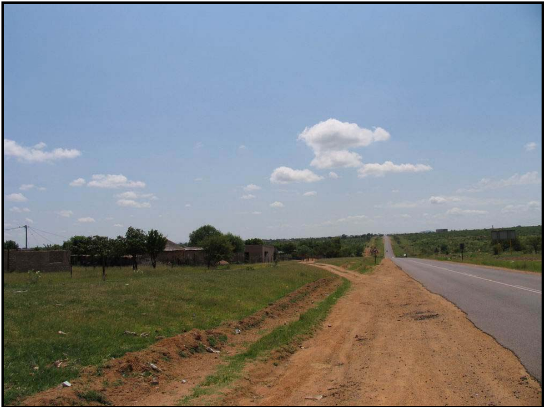
Fig. 3. Showing a section of the road where the proposed pipeline will be installed.