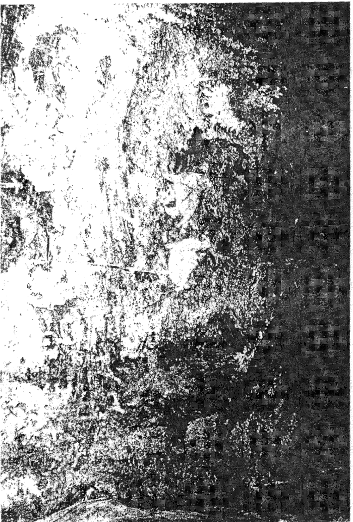
IN TOP LEFT OF PHOTO LATE WHITE PAINTINGS: TOP RIGHT OF EZEMVELO ROCK SHELTER