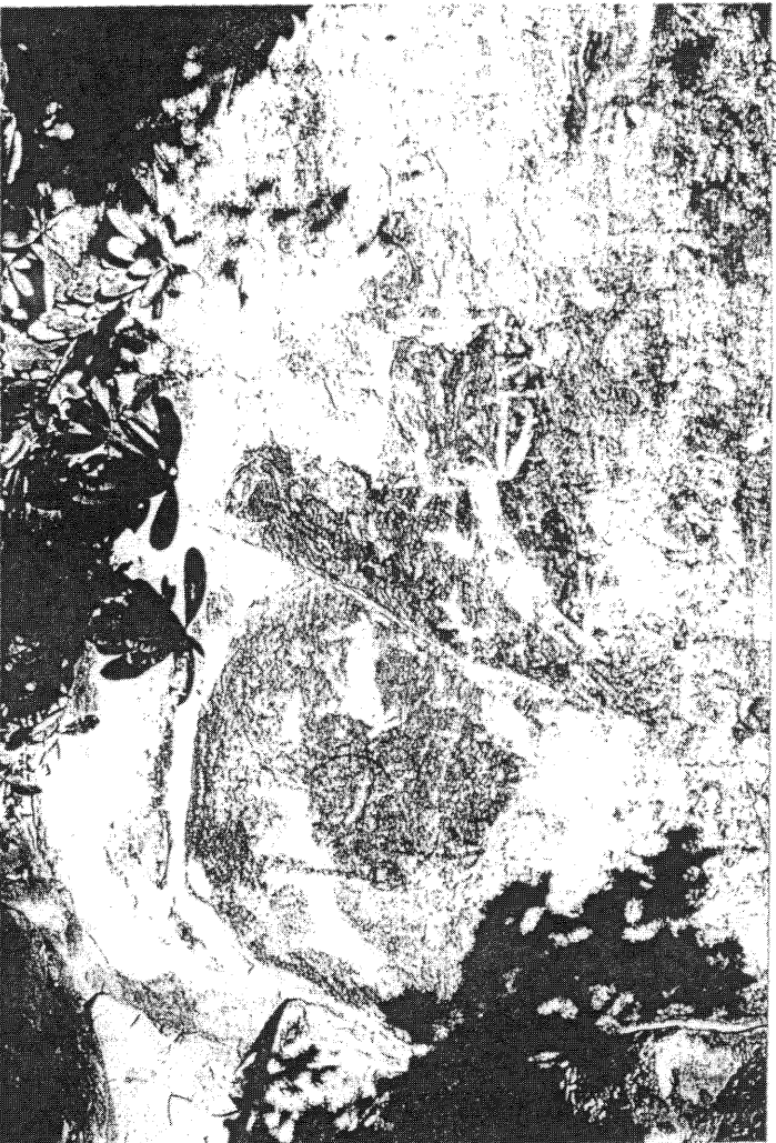
EZEMVELO ROCK ART SITE: LOWER RIGHT HAND SIDE OF SHELTER UNFINISHED OUTLINE OF ELEPHANT WITH CENTRAL ELAND (SAN?)