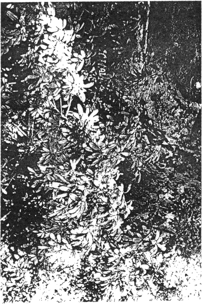
INDIGENOUS TREES GROWING IN FRONT OF ROCK FACE