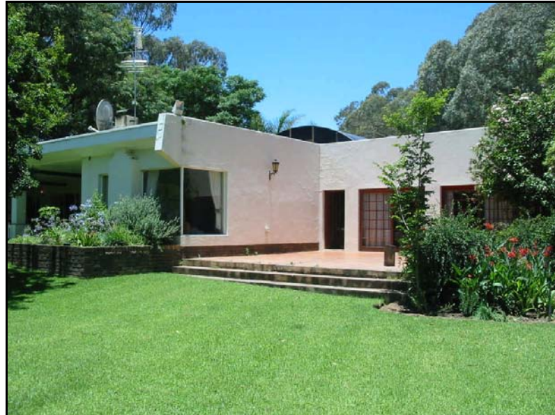
• Figure 1: Modern dwellings on site

The proposed development area of approximately 2.5ha is densely build and ground visibility is low. The buildings consist of modern dwellings and horse stables. These features are not older than 60years or of any heritage significance. No further action is needed in order for development to commence.