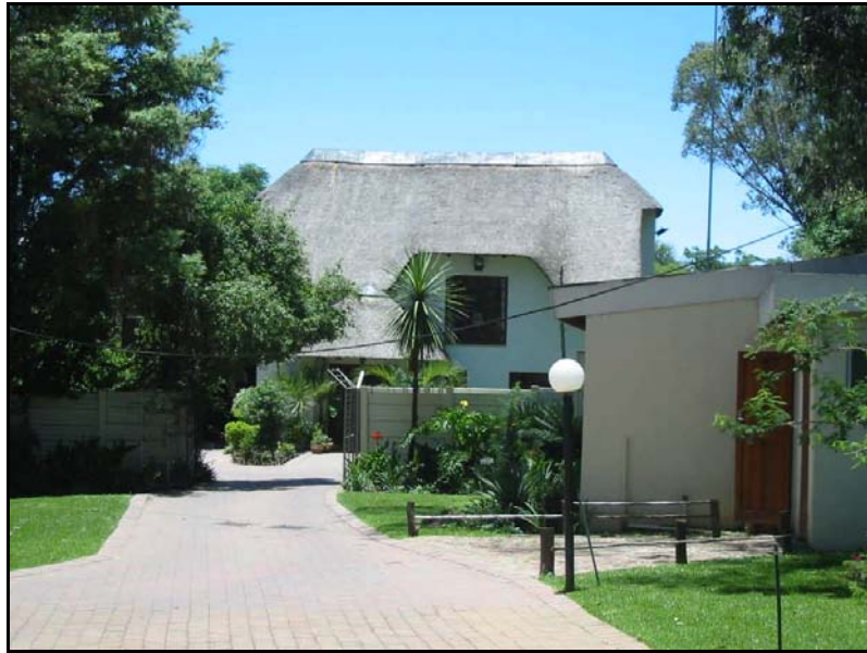
• Figure 2: Modern dwellings on site