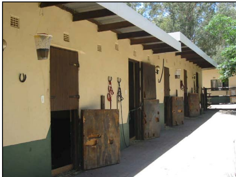
• Figure 3: Horse stables