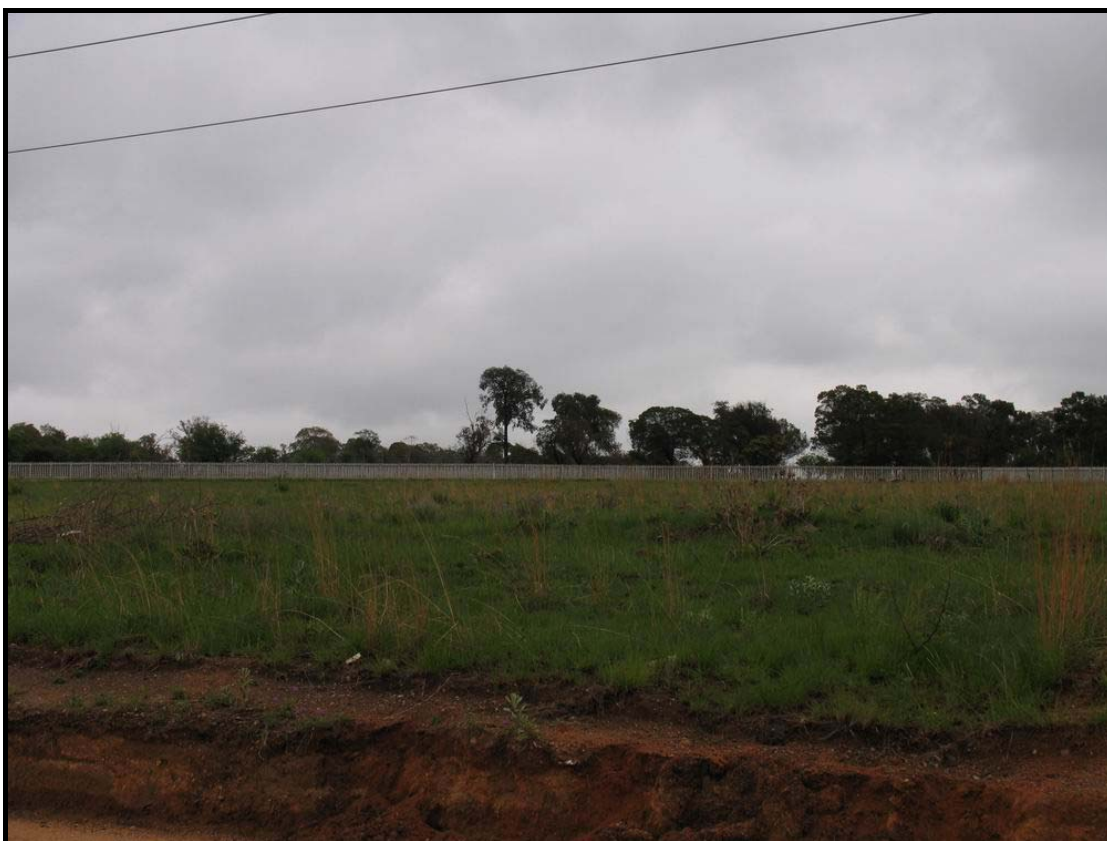
Fig. 2. A view over the site.

No sites, features or objects dating to the historic period were identified in the study area.