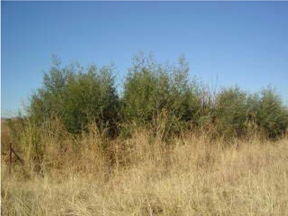
No. 1 Wattle Trees in the cemetery