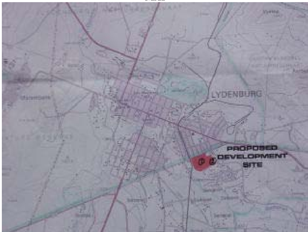
(1) Cemetery (2) Orchard and dam