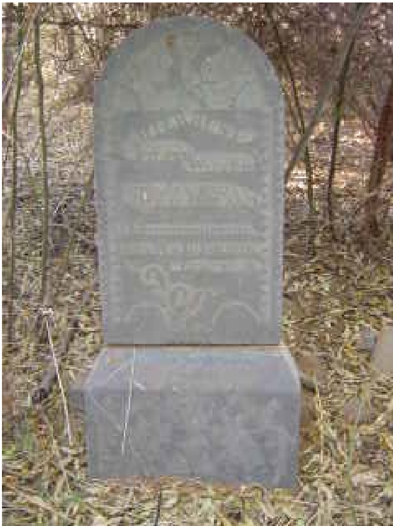
No. 4 Hand carved tombstone with folk art motifs