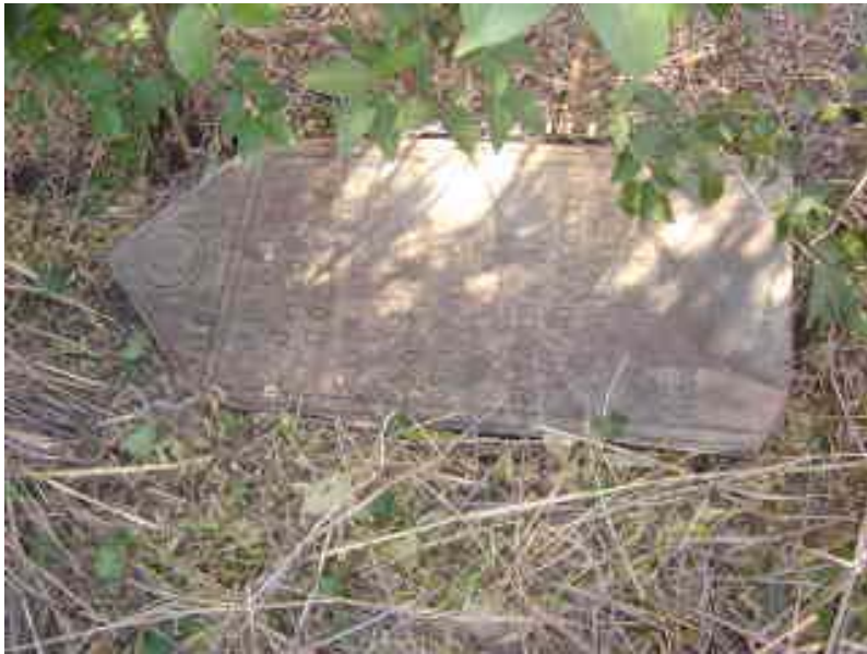
No. 3 One of the broken tombstones