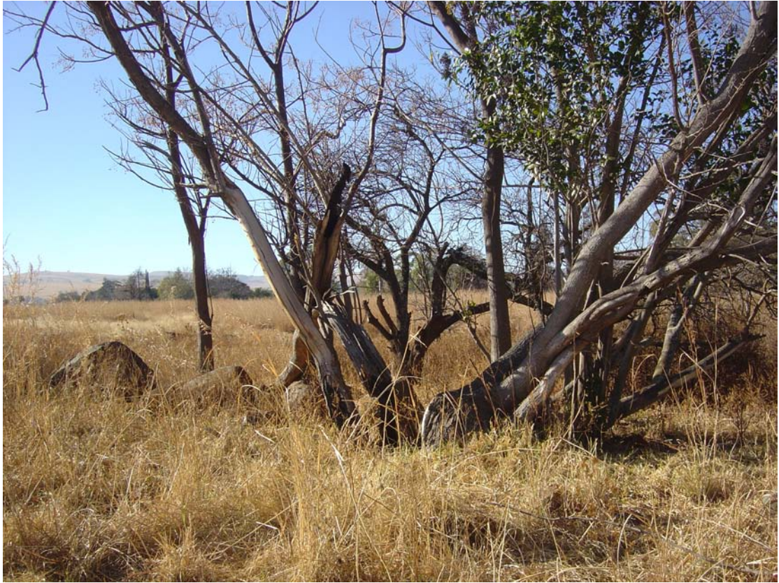
No. 5 Stonewall with exotic trees and orchard as well as dam