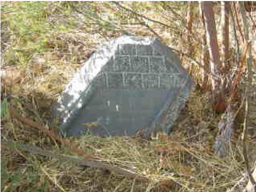
No. 2 One of the slate tombstones still intact