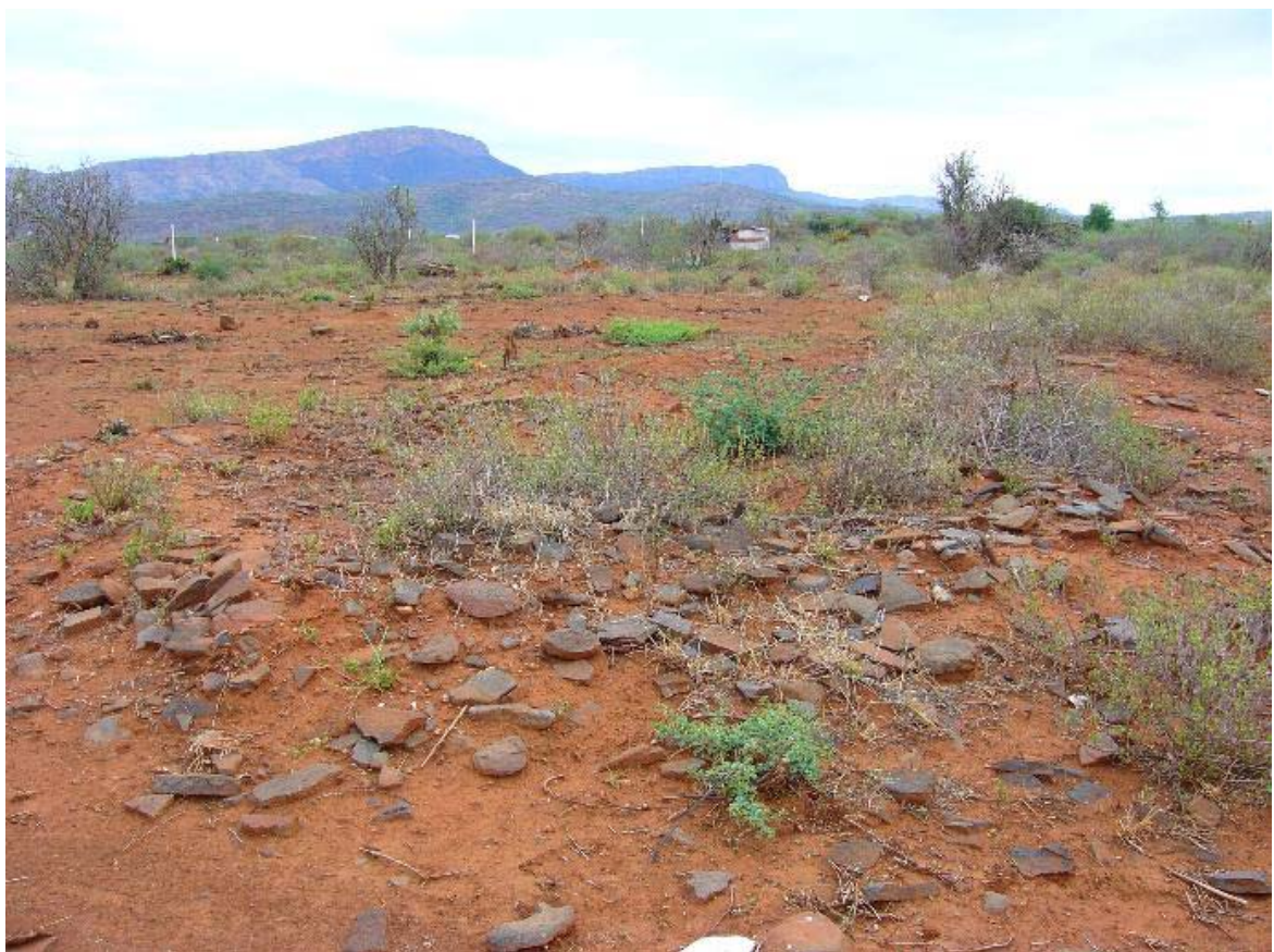
Fig 2. View of one of the recent historical stone foundations