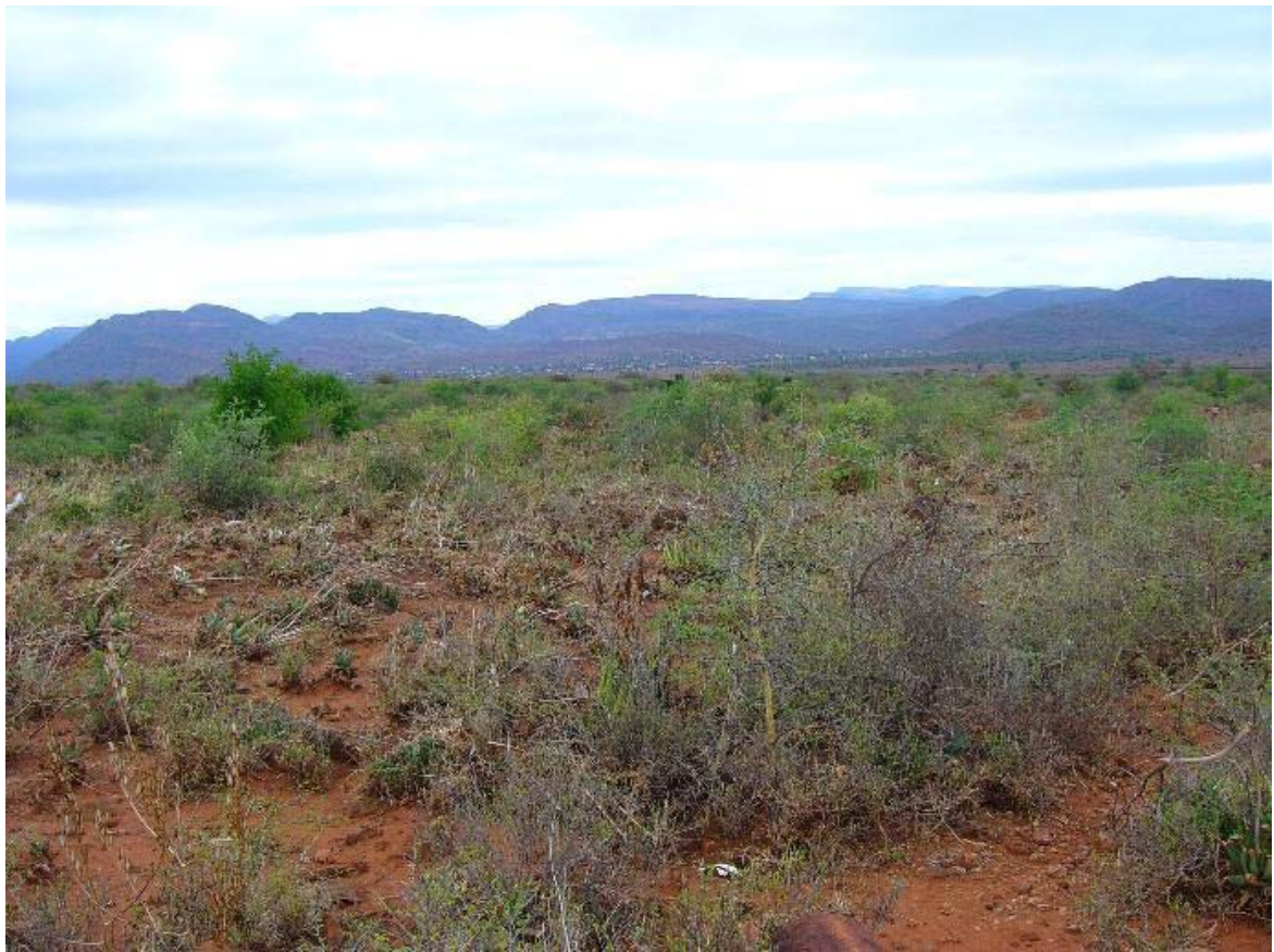
Fig 1. General view of the area