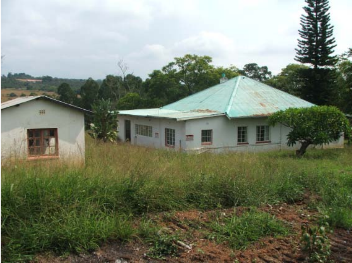
Fig 1. Site 1. The house indicated as site NTR 1.