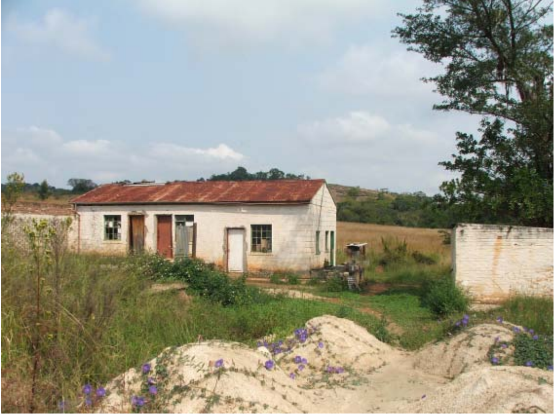
Fig 2. Site 2. The dwelling indicated as site NTR 2