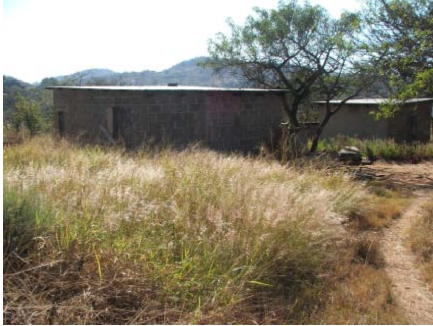
Fig 1. Site SRN 1. Farm workers dwellings.