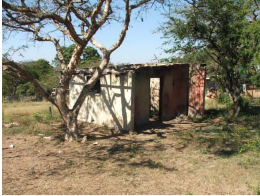
Fig. 3. Site SRN 3. Ruin.