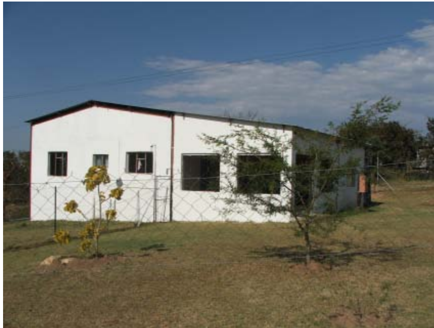
Fig. 4. Site SRN 4. Farm dwelling. Not significant.