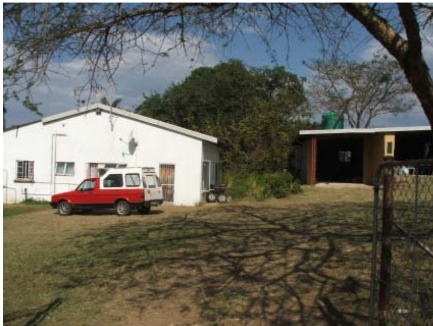
Fig. 6. Site SRN 5. A second structure at MN 5. Not significant.