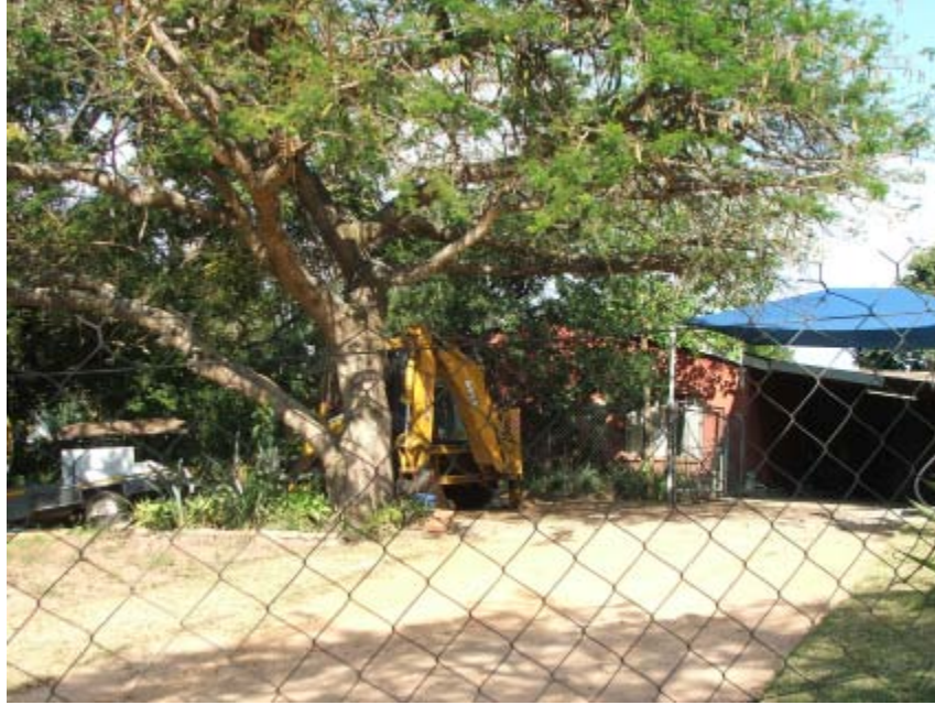
Fig. 5. Site SRN 5 . One of the houses. Not significant.