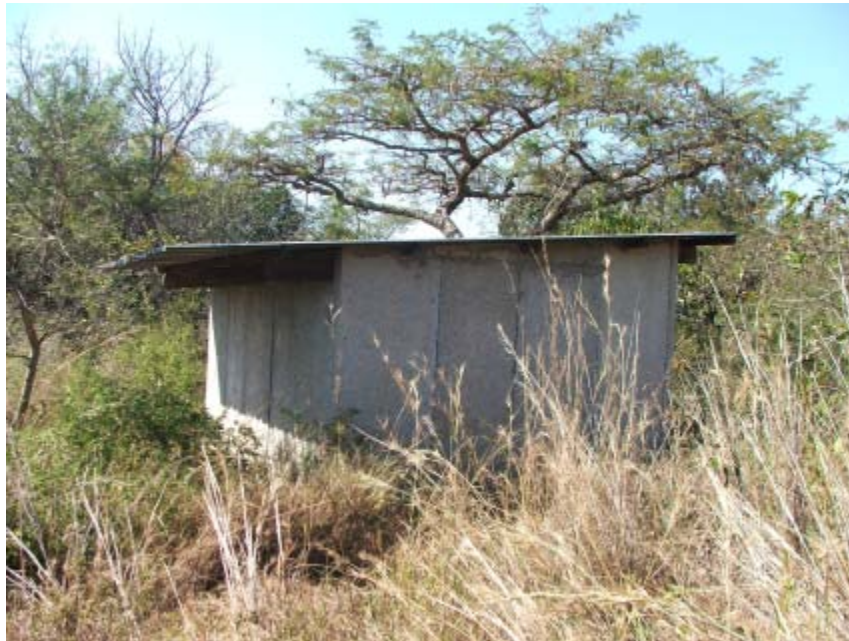
Fig 2. Site SRN 2. Small building. Not significant.