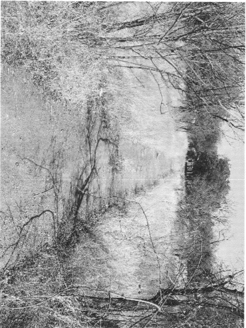
Fig 1. General view of the terrain in a westerly direction towards the existing residential area.