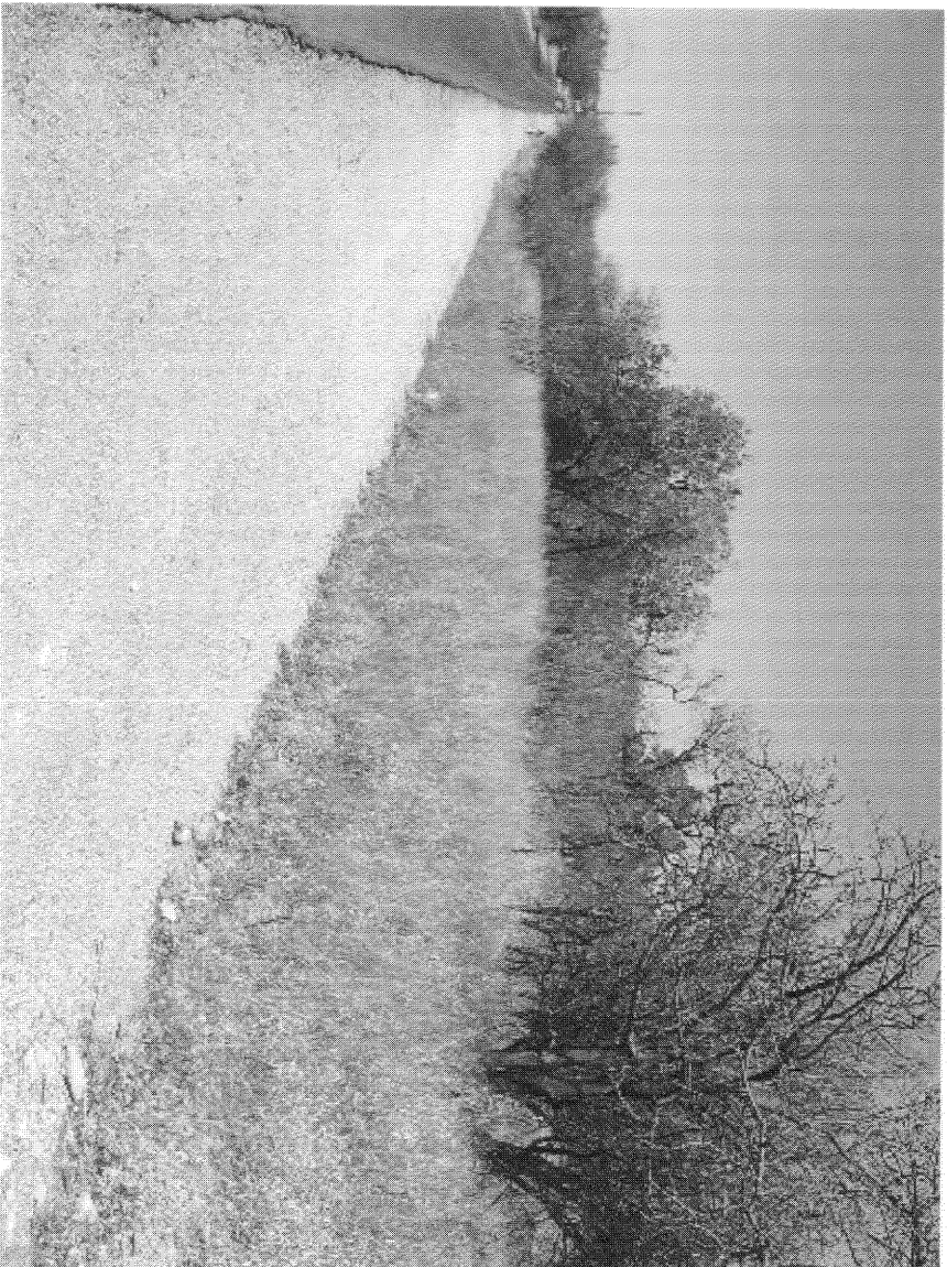
Fig 2. General view of the terrain in a southerly direction standing on the eastern side.