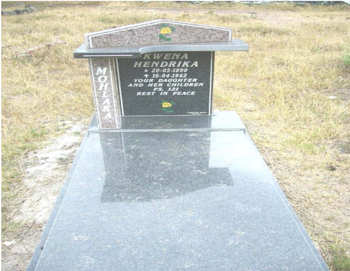
Fig 3. Marked grave.