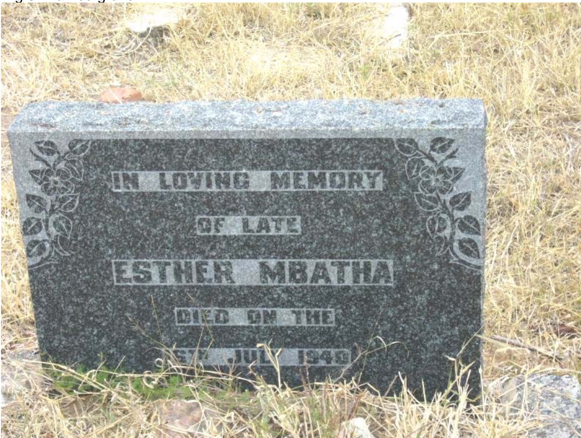
Fig 4. Marked grave.