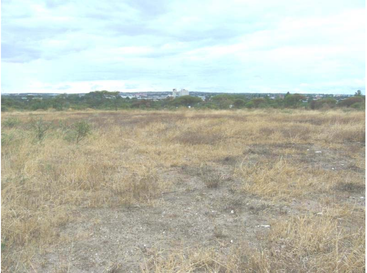
Fig 1. General view of the area.