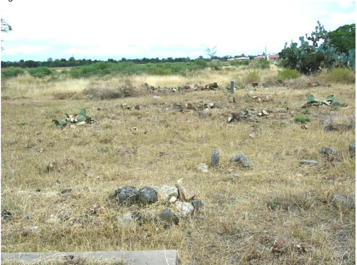
Fig 2. Part of the cemetery, note unmarked graves.