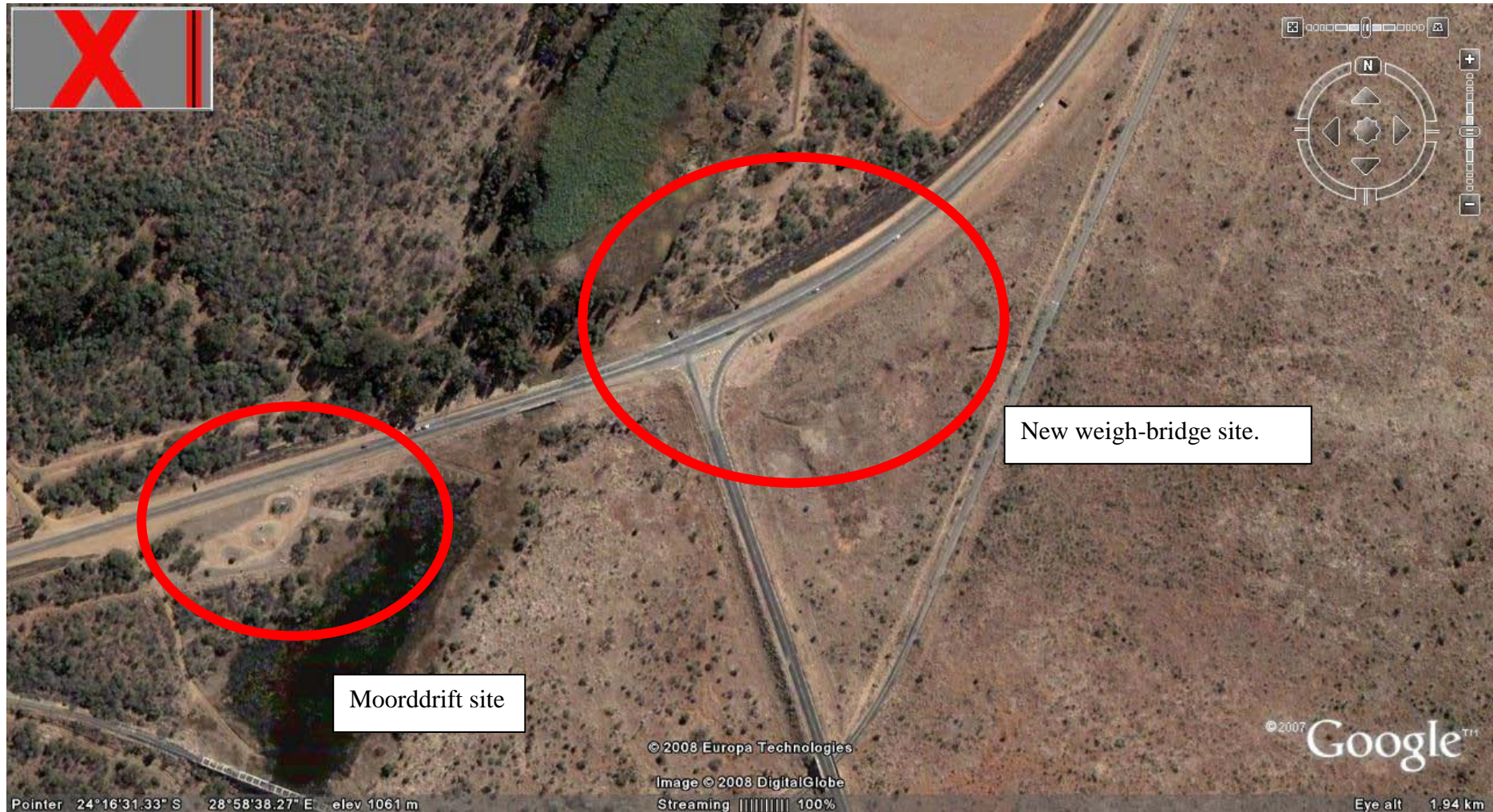
Position of weigh-bridge relative to the old Moordrift site on Google Earth.