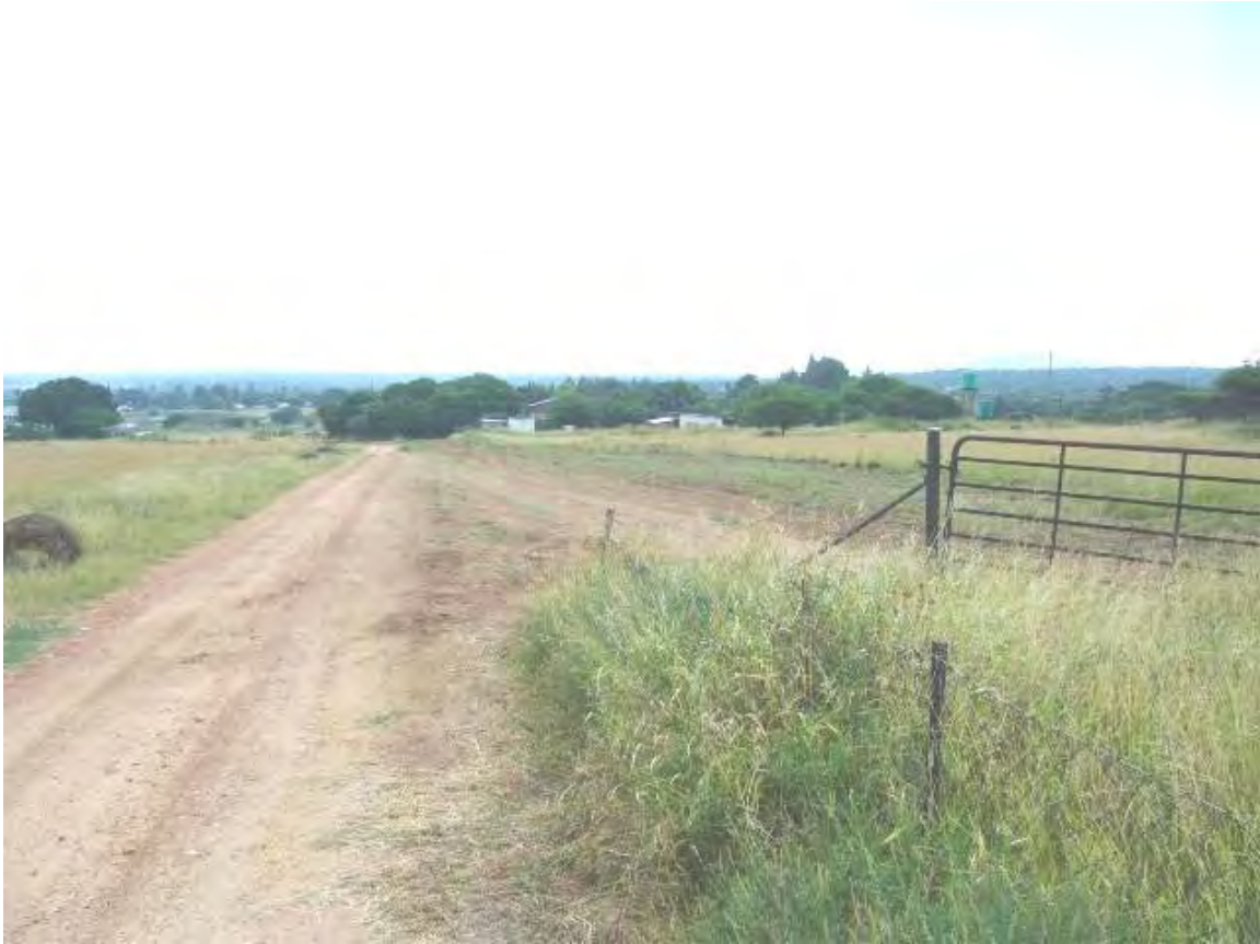
Fig 1. General view of the area.