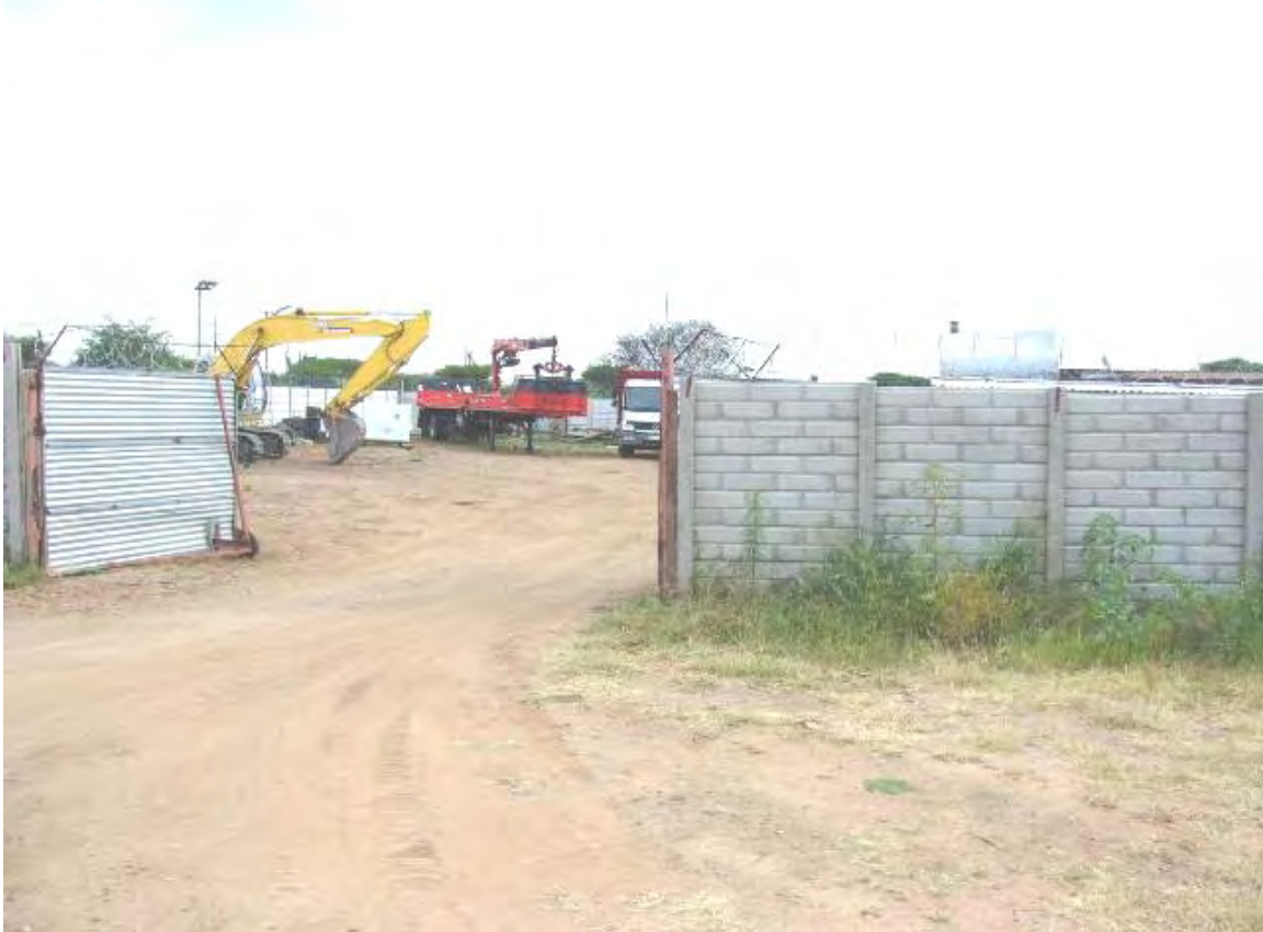
Fig 2. Walled area that appears to be a machine plant yard.