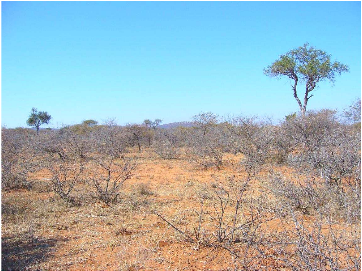
Fig. 1 General view of development area.