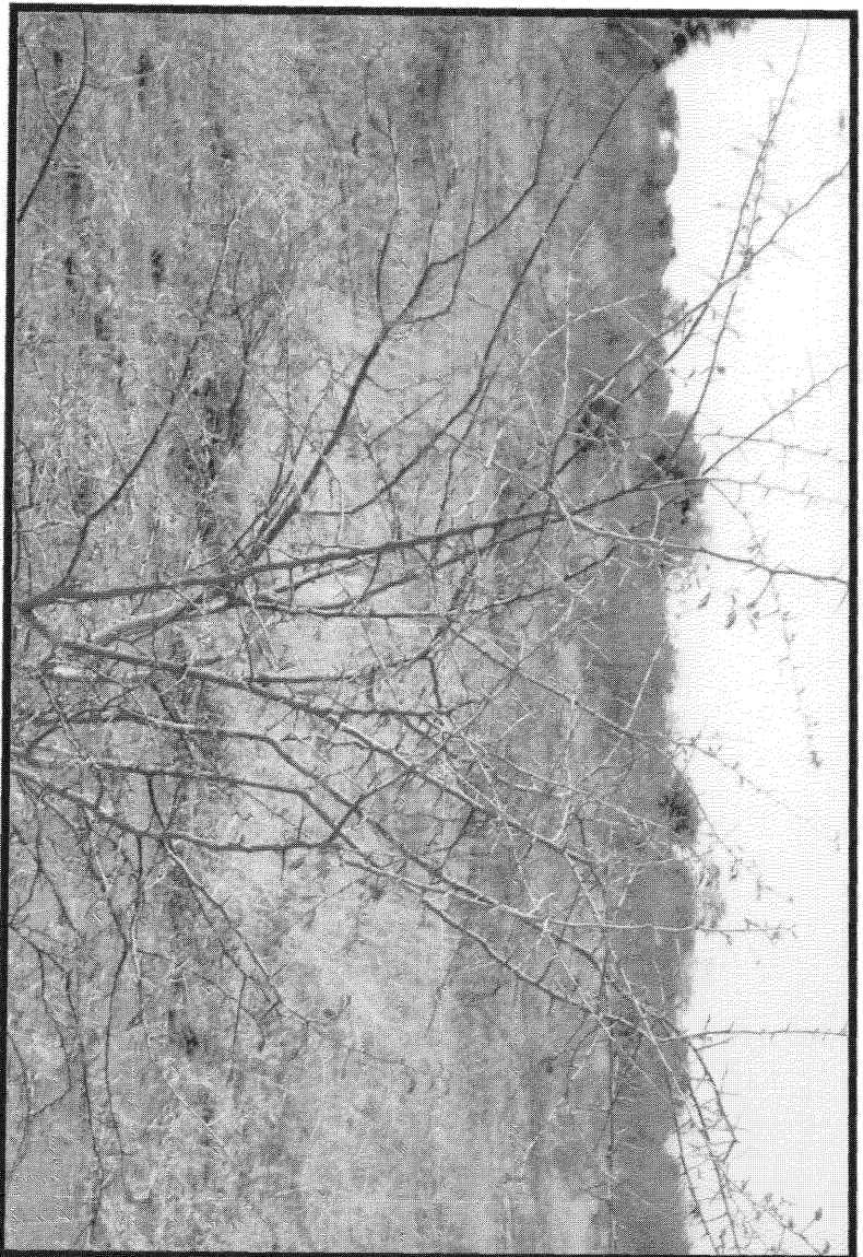
Figure 2: View of the identified site for filling station along the road to Mmakotse.

Mmakotse village is located at about 3km west of Lebowa Kgomo town at the southern side of the tarred road to Zebediela village. The affected area was used for grazing (GPS S24.31993;E29.44767 ;)