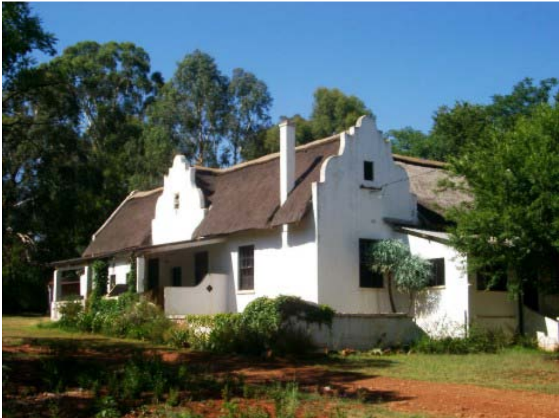
Figure 3. The 1936 house.