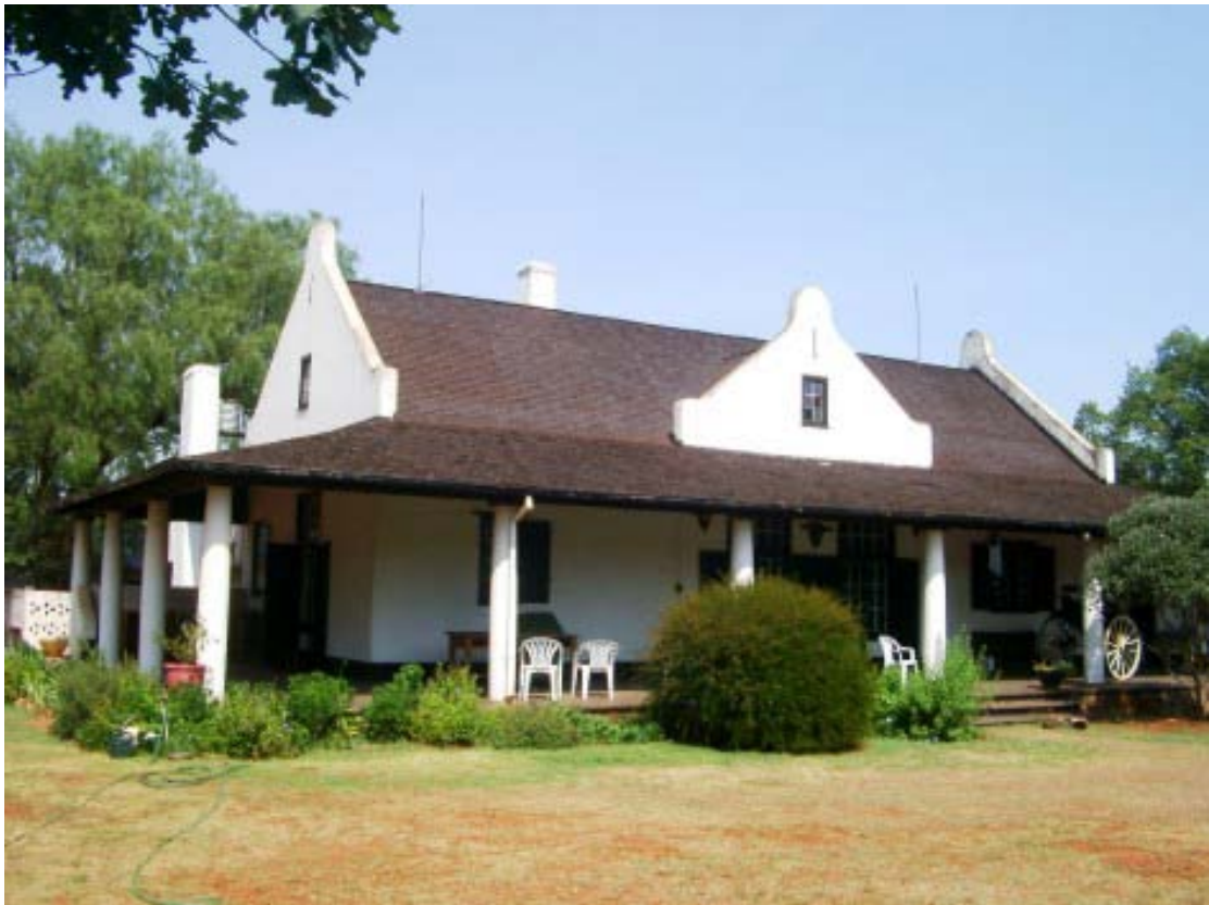
Figure 2. The old farmstead dating to 1904.