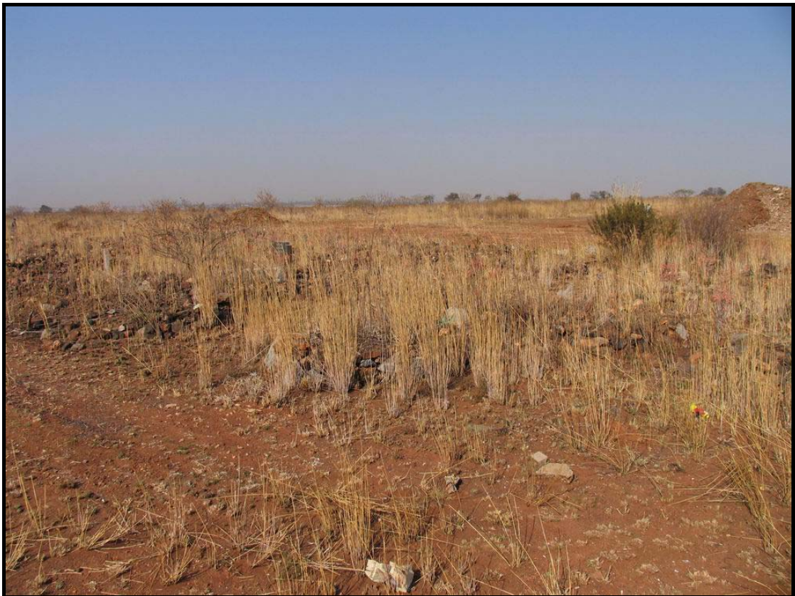
Fig. 2. A section of the cemetery, showing a large number of unmarked graves.

Legal requirements : Notification, consultation, permits, SAHRA permits