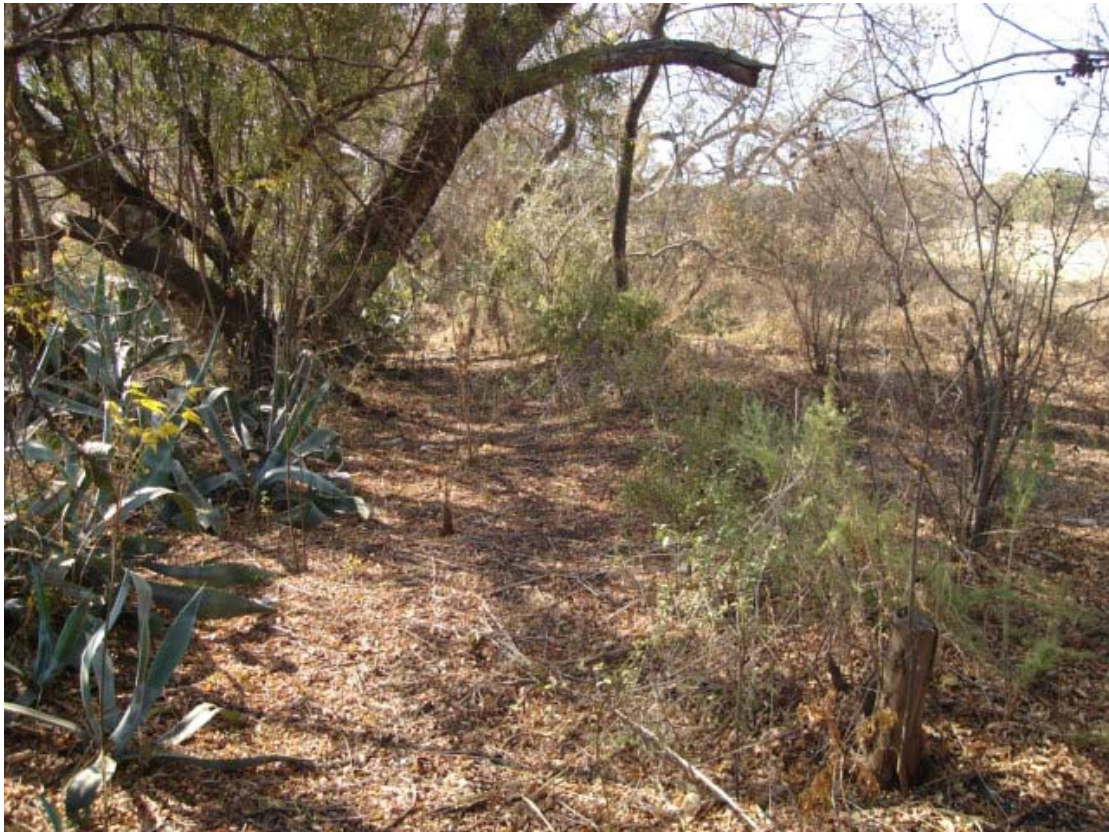
Remains of old water canal