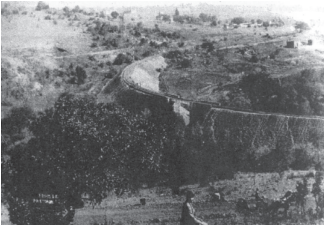
Figure 7 Photograph with the NZASM bridge in the foreground taken from the south-east looking towards where Pretoria station is today.

It is important that this feature be interpreted and protected from further damage. It was noted on the first visit to the Reserve that this area in particular is a security risk to visitors so urgent attention needs to be given to proper security. Upon consulting with David Boshoff 20 it was stated that the problem is being addressed and plans have the area fence the off with daily patrols are being considered to remedy the problem 25 . Visitor access to the remains of the bridge also needs to be improved by means of a path and proper signage. The area around the bridge seems to be neglected and the vegetation needs to be cleared and kept in check, this may already greatly contribute to the securing the area.