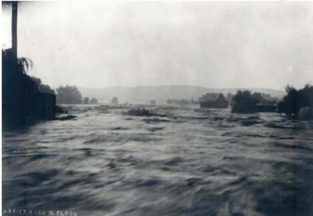
Figure 4 Photograph of the Apies River in flood (1897), Van der Waal collection, University of Pretoria Archives.

but torrential afternoon downpours. These rainstorms are often accompanied by devastating floods in the area of the Apies River.