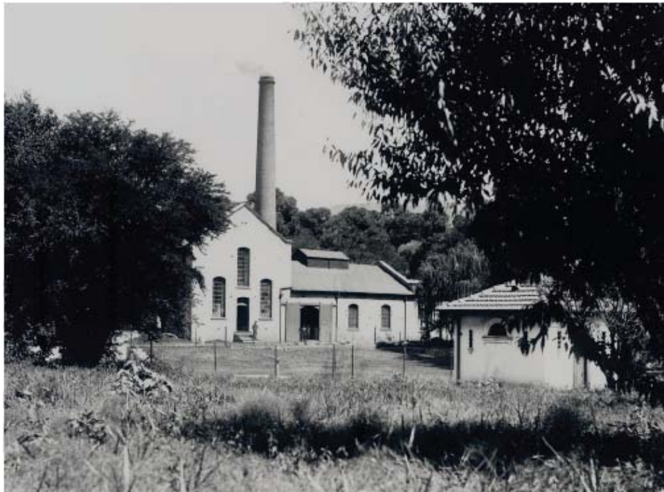
Figure 5 ZAR pumping station.

The 2006 report suggested, that this particular building be utilised as a formal exhibition centre, as this will be of great value to the preservation of this structure. 14 After consulting with John Cooper, at this stage this is not viable since the pumping station is still in use and generates a fair amount of noise. 15 If restoration is considered careful attention must be given to the policies set out by SAHRA.