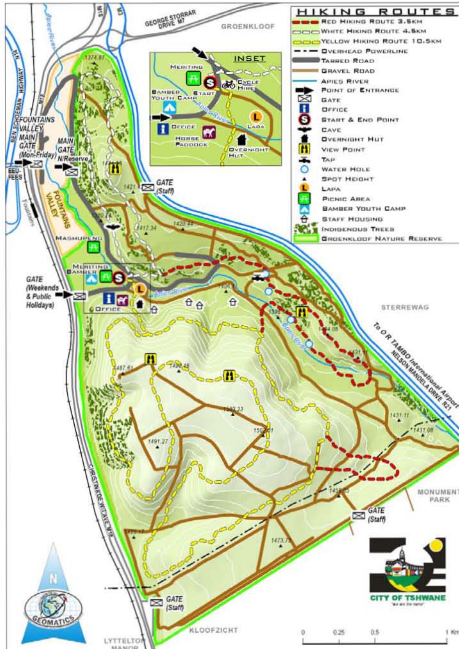
Figure 1 Map of the hiking routes in the Groenkloof Nature Reserve from which the boundaries can be seen.

The Reserve may be described in terms of a large triangle facing north to south. It is bounded by two highways the M18 and R21 that form two of the major entrances to the city centre. The suburb Monument Park extension 2, Waterkloof Airforce Base and the suburb Kloofsig serve as the southern border.