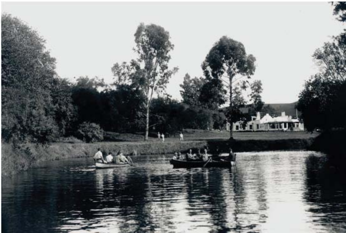
Figure 6 Fountains Valley hotel, Van der Waal collection, University of Pretoria Archives.