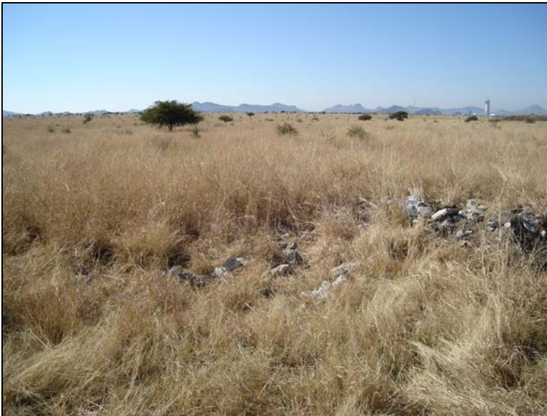
Fig.4 General view of the area outside Rustenburg.