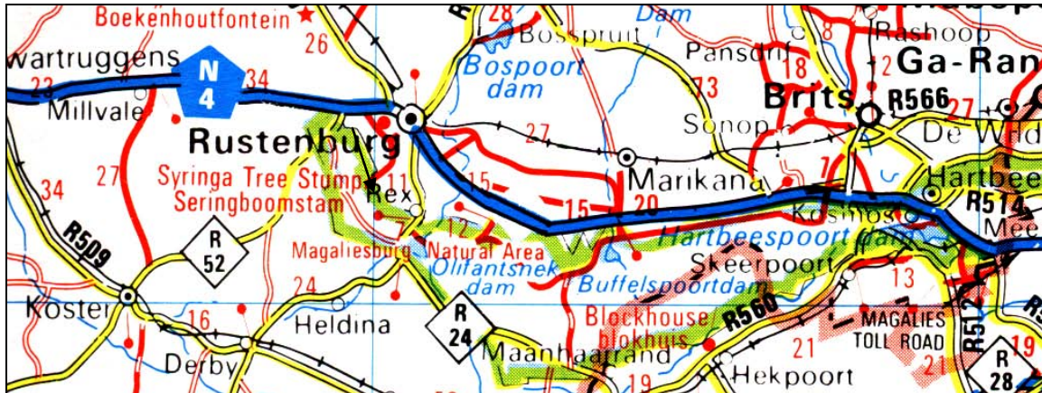
Map 1 Locality of Rustenburg in relation to other towns in the North West Province.