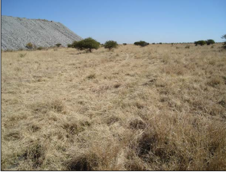
Fig.1 View across the area of development at the foot of the mine dump.