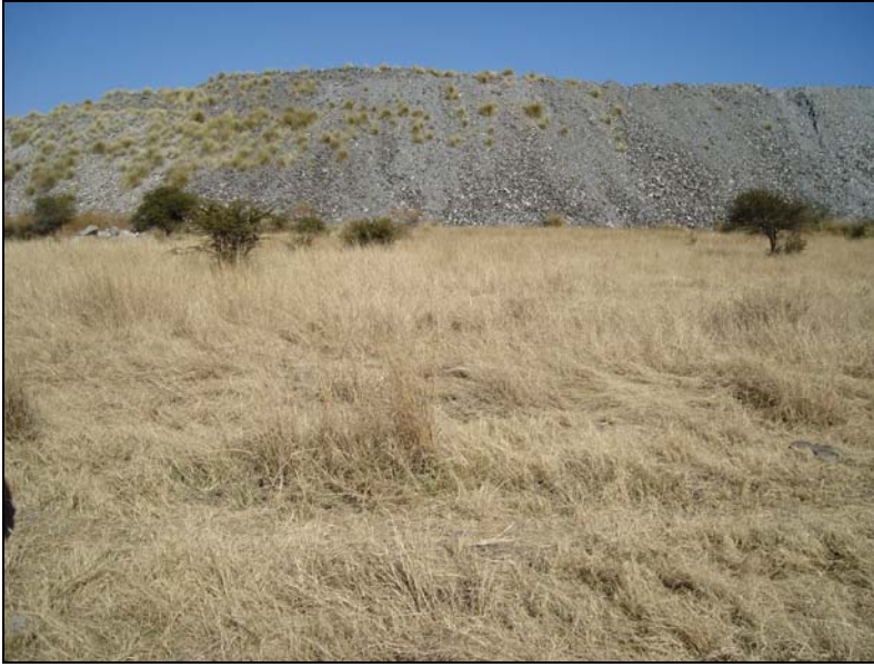
Fig.3 View of the mine dump across the area of development.