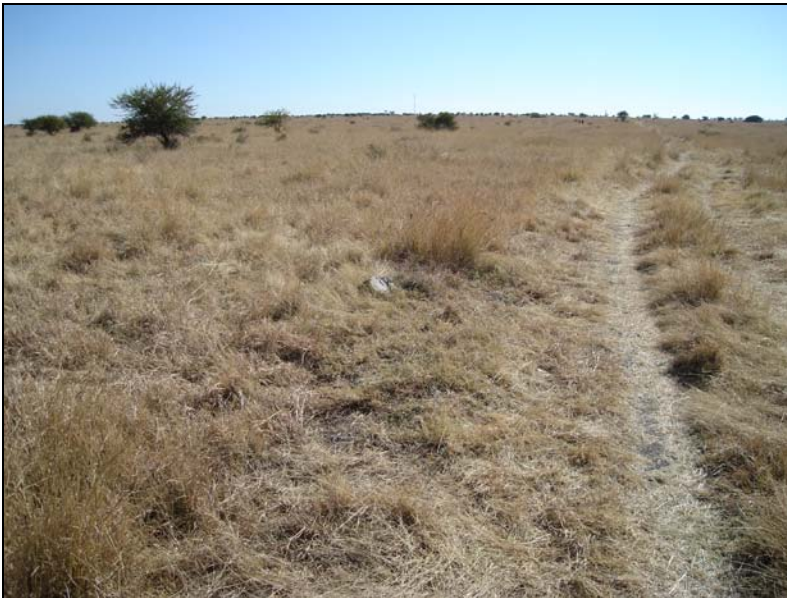
Fig.2 The land consist of black clay soil and is grass covered.