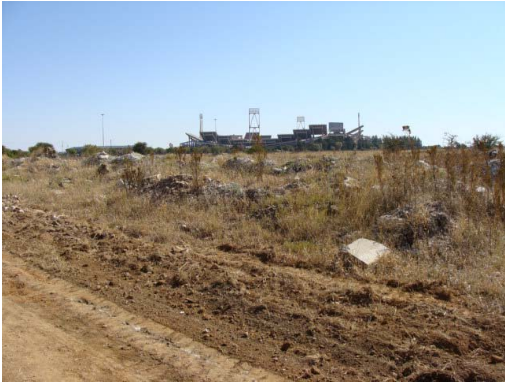
Figure 2 General view of the surveyed area.