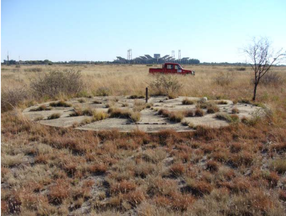
Figure 4 Concrete floor of a rondavel type building from site no 1.