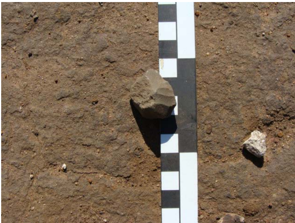
Figure 3 Late Stone Age core used for the manufacturing of lithic tools.

Some Late Stone Age cores and blades were also found at the following GPS coordinates: 25°49'34"S and 25°37'38"E. It is therefore clear that the area had been used by Stone Age people.