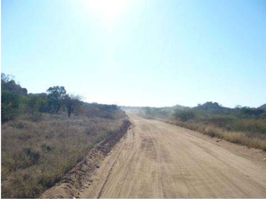
Fig. 1 General view of the road