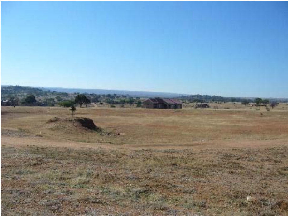
Fig. 2 Borrow pit 4