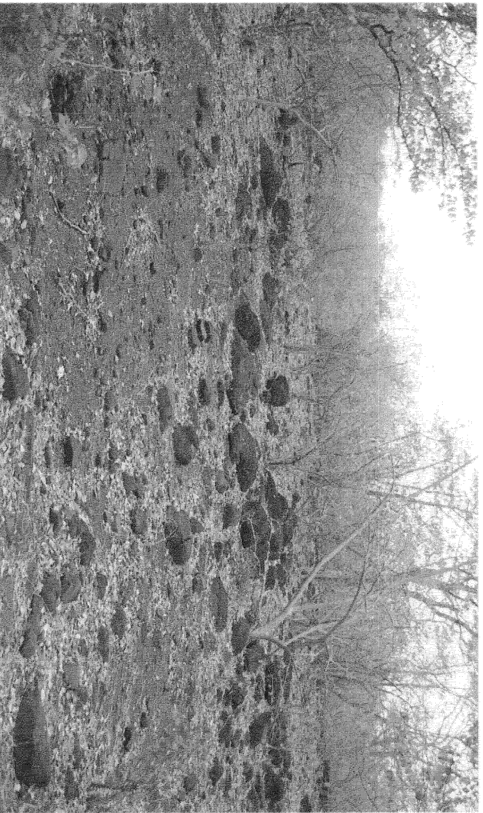
Photo 2. The proposed area for muswubi entertainment, Bennde- Mutale lodge.