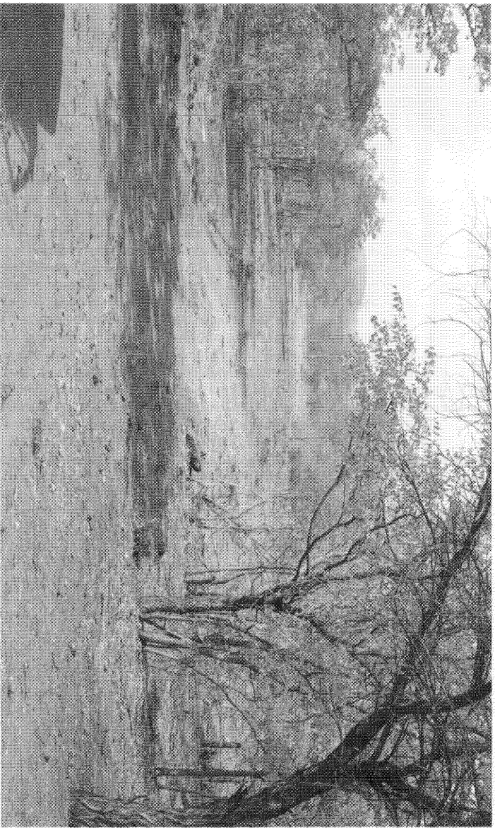
Photo 1. View of the proposed access road from the main fare road running to the south toward the Mutale River where the proposed lodge site is situated.