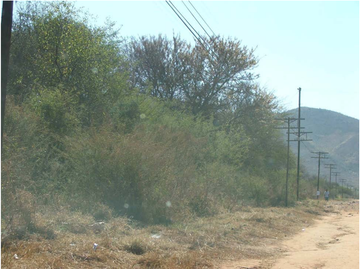
Photo 1. Proposed site for development.