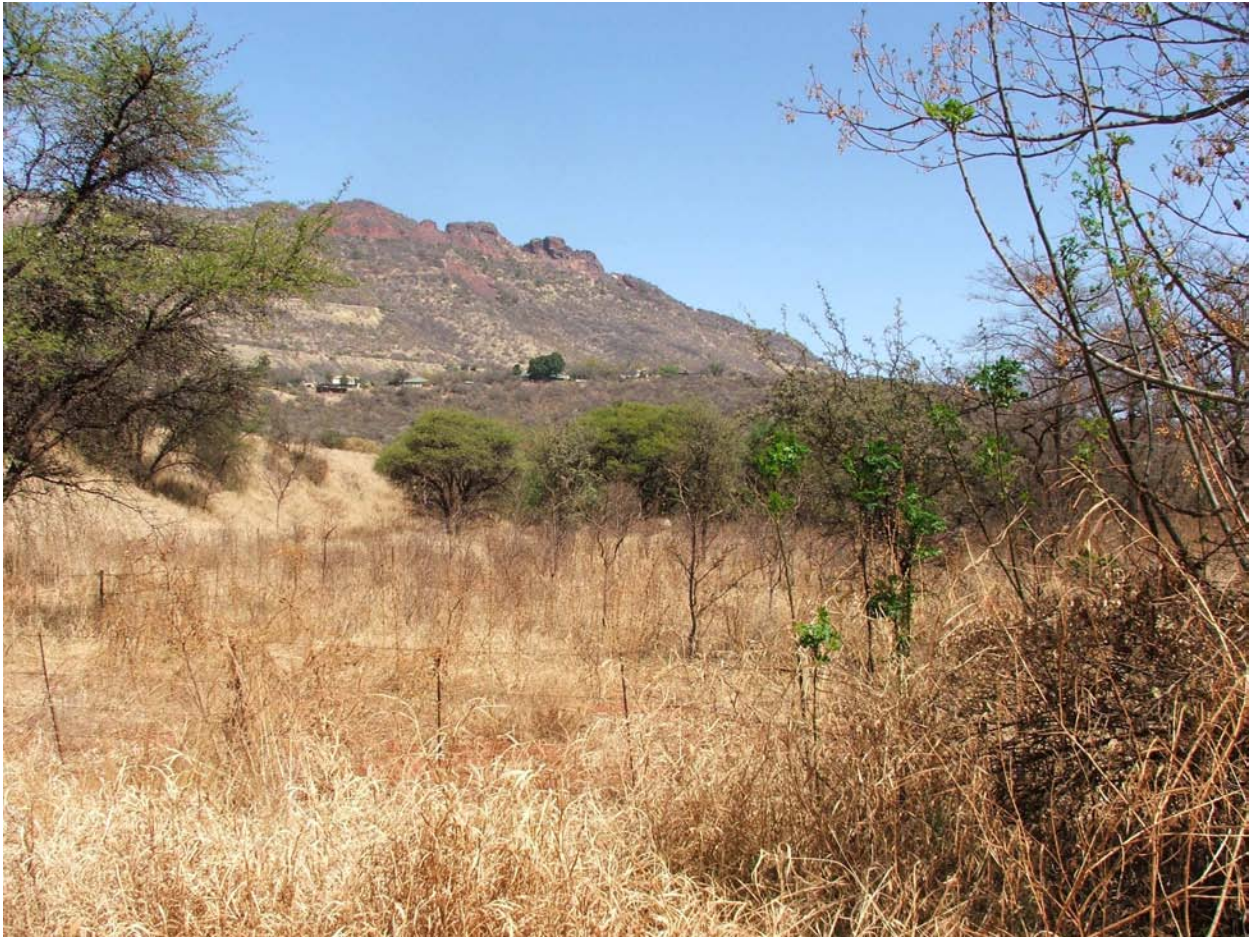
Photo 1. Proposed site for development.