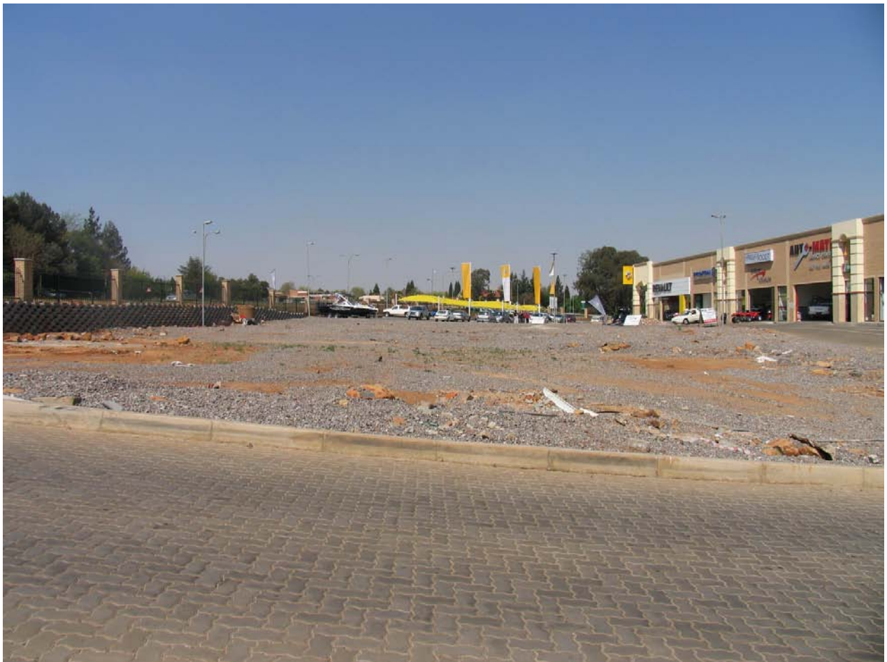
Figure 2. The site, showing the amount of excavation already done, by measuring it against the wall on the left hand side of the photograph.