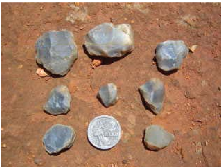
Late Stone Age cores and flakes